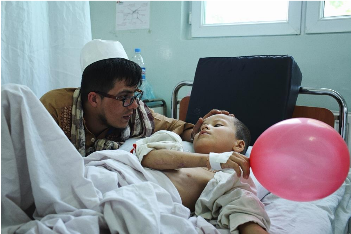
18 May 2015 – A young patient, whose leg was severely damaged when struck by shrapnel from a mortar, is visited by his father at the MSF Trauma Centre in Kunduz, Afghanistan.