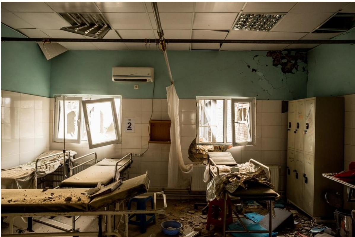
10 October 2015 – Burnt-out corridors, collapsed roofs, twisted metal and ash, is all that remains of many building at the MSF Trauma Centre in Kunduz, Afghanistan, following the 03 Oct US airstrike on the facility.