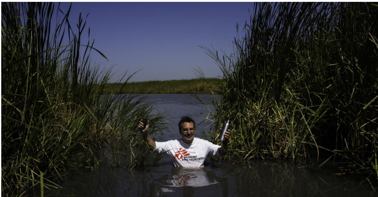
16 December 2015 – An MSF team member makes his way through swamps towards Kok Island to distribute medical supplies and food to people hiding from violence in Unity state, South Sudan.

Finally, the network of university student societies, the Friends of MSF, is noteworthy. At the end of 2015 there were 35 such societies at universities around the UK, primarily made up of medical students. As well as providing a pool of future medical staff for the organisation, the Friends societies also are very active in raising money for MSF's field work and helping to raise awareness among UK students of the challenges MSF faces in the field.