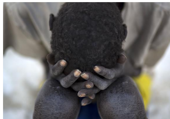
(L-R) 3 March 2016 – Mary takes shelter in an MSF clinic in a camp for displaced people in Pibor following days of fighting in Unity state, South Sudan. © Jacob Kuehn/MSF; 3 March 2016 – During heavy fighting in Pibor in February 2016, many homes throughout town were burnt, looted and destroyed. © Jacob Kuehn/MSF; 13 January 2015 – A kala azar sufferer rests at MSF's hospital in Lankien, South Sudan, © Karel Prinsloo; 17 December 2015 – An MSF staff member helps a young boy cross the swamps around Kok island after receiving food aid for the first time in months, Unity state, South Sudan, © Dominic Nahr.