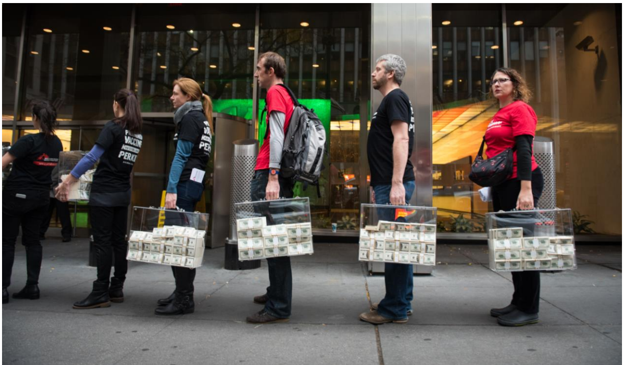
12 November 2015 – MSF volunteers attempt to deliver more than US$17 million of fake cash – the equivalent of one day of profits from the pneumonia vaccine for Pfizer globally – to Pfizer's CEO Ian Read in New York.

OCA's second strategic grouping lies in strengthening our resources and infrastructure. We will improve our human resources to ensure continuity and enhance leadership skills, and we will improve the infrastructure around our service delivery to medical operations. It is also important to ensure that we have the financial strength needed to support operations, and to ensure good internal communication and coordination.