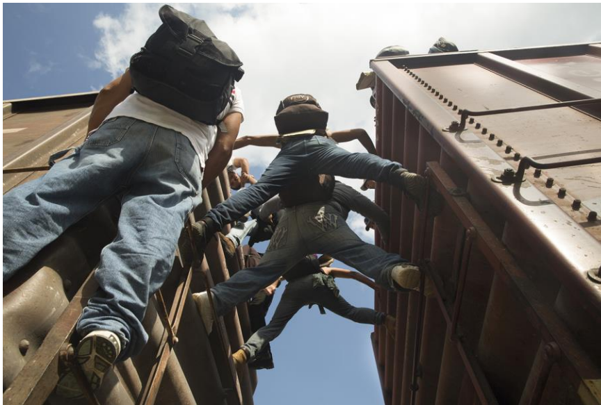
15 June 2014 – Men travelling from Central America jump a train in Mexico headed for the US border. Almost 60 per cent of the migrants treated by MSF in Mexico have suffered episodes of violence along their route.

Some 300,000 Central Americans enter Mexico every year, many of them hoping to enter the US. Journeying by boat, on foot, and on a notorious train known as 'the Beast', they cover thousands of miles, but along the way, many find the very same thing they are fleeing: violence. Migrants are preyed upon by criminal organisations and plagued by theft, extortion, mugging and rape, often leaving them injured or psychologically traumatised. But because of their legal status, they cannot access basic healthcare to help them recover while on the move. MSF has established a series of clinics that offer medical and mental healthcare at key points along the route.