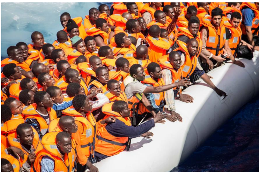
18 September 2015 – People heading across the Mediterranean sea to Europe in a rubber dinghy are rescued by an MSF search and rescue ship off the coast of Libya.

The majority of people rescued by MSF told us that they had not wanted to leave their homes, but did so because they had no other choice – they were fleeing for their lives. From the increasingly brutal war in Syria, to the difficulty of life under an oppressive dictatorship in Eritrea, everyone we met had a very strong reason for fleeing their country.