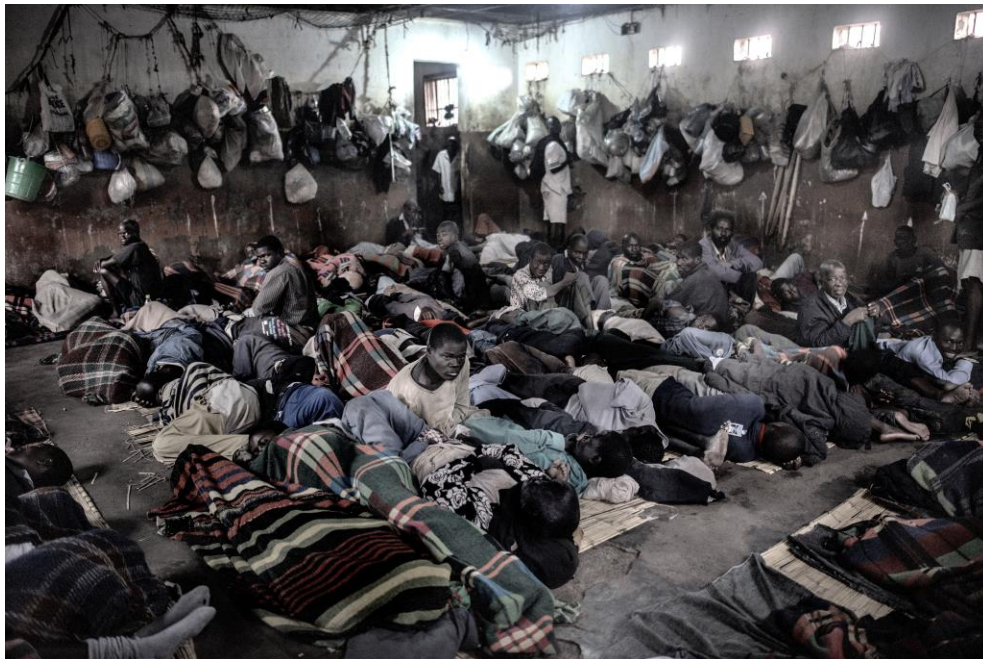
26 May 2015 – Prisoners wake up in a cell in Chichiri prison in Blantyre, Malawi, after 14 hours spent in cramped and unhealthy conditions.

In some countries, prisoners have little or no access to healthcare. Short of food and water, and confined in unhygienic cells, conditions such as malnutrition, dehydration, and skin and respiratory infections are common. When cells are overcrowded, they can become breeding grounds for infectious diseases such as tuberculosis.