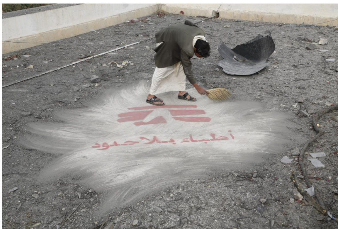
29 October 2015 – A man clears debris from the roof of MSF's hospital in Haydan, Yemen, after an airstrike destroyed much of the facility.