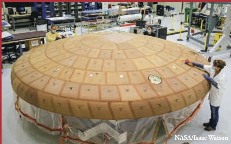
Above, technicians at NASA's Kennedy Space Center in Florida meticulously applied more than 180 blocks of ablative material to the heat shield for the Orion spacecraft set to carry astronauts around the Moon on Artemis II.

The OHSS will be mounted to a structure outside the Orion pressurized crew module and underneath the backshell thermal protection system, and