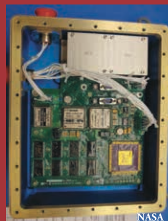
At left, The Orion Heat Shield Spectrometer flight unit assembly is pictured without the top lid installed.

Below, The Orion spacecraft for NASA's Artemis I mission is in view inside the Neil Armstrong Operations and Checkout Building high bay. Attached below Orion are the crew module adapter and the European Service Module with spacecraft adapter jettison fairings installed. NASA Armstrong is assisting with the Orion Heat Shield Spectrometer system for the Artemis II mission to be installed on Orion and connect through a fiber optic cable to the heat shield. The Orion capsule is the silver item in the stack.