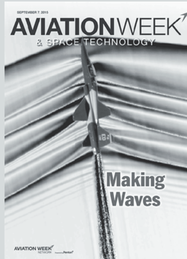
Reproduced with permission

The Aviation Week 100th Anniversary edition was recently published with a prominent award going to a project based at NASA Armstrong. There was a competition for selecting the best cover images from the magazine's 5,200 editions in multiple categories. The NASA Armstrong air-to-air background oriented schlieren, or AIRBOS, image of shock waves from a United States Air Force Test Pilot School T-38 that appeared on the cover of the digital magazine from September 7, 2015, made the list of the five most memorable covers. Researchers used NASA-developed image processing software to remove the desert background, then combined and averaged multiple frames to produce a clear picture of the shock waves.