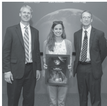
AFRC2016-0133-05