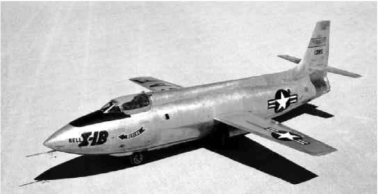
Photo E-2539. X-1B on lakebed.

The second generation X-1s used the same wing, horizontal tail, and XLR-11 rocket engine as the first generation aircraft, with a new cylindrical fuselage just over 4 1/2 feet longer than the original design. This was the maximum length that could be carried by a B-29 or B-50 launch aircraft. The cockpit design was also changed to a “stepped” canopy, allowing the pilot to enter from the top, instead of the side hatch on the original X-1. A more significant change was the fuel system. The new aircraft used a low-pressure turbopump, which eliminated the heavy spherical liquid oxygen (LOX) and alcohol tanks. The new, larger tanks now conformed to the fuselage shape. As a result, the airplane’s calculated maximum performance had increased to Mach 2.47 at 70,000 feet.