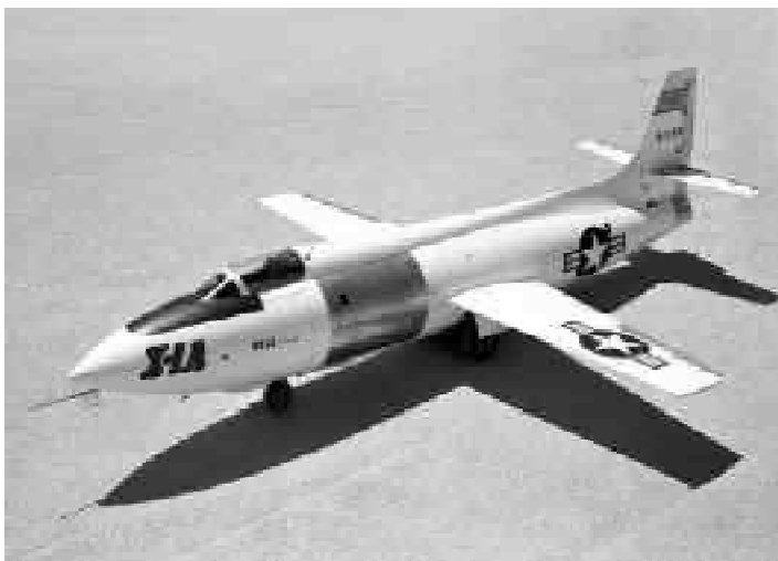
X-1A on lakebed.

The X-1A was turned over to the NACA for high-