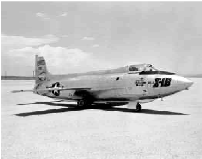
Photo E-4097. X-1B on lakebed.

The X-1A was the fourth rocket plane destroyed by explosions. The others were the X-1D, the X-1-3, and the X-2 #2. The investigations following each crash found no common factor in the accidents. After the X-1A crash, the debris was brought in from the desert and laid out on a hangar floor. The X-1B which had returned from modifications only a week before the loss of the X-1A, was parked next to the debris. When the X-1B's liquid oxygen (LOX) tank was examined, tricresyl phosphate (TCP) was found in both the LOX