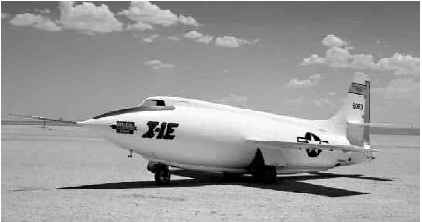
Photo E-1920. X-1E on lakebed.

The NACA X-1E was the last of the X-1 series of aircraft, and its construction benefited from the lessons of earlier research aircraft programs. This included the explosions which destroyed the X-1D and the X-1-3 research aircraft, the poor performance of the X-3, and the destruction of both X-2s.