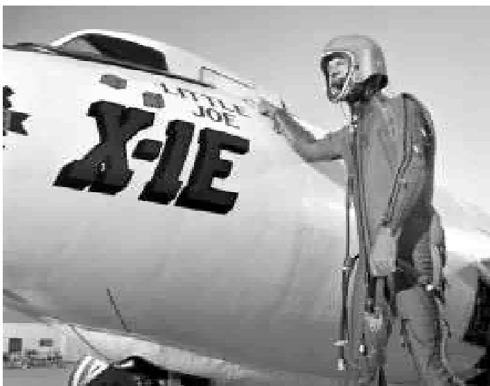
X-1E with pilot Joe Walker.