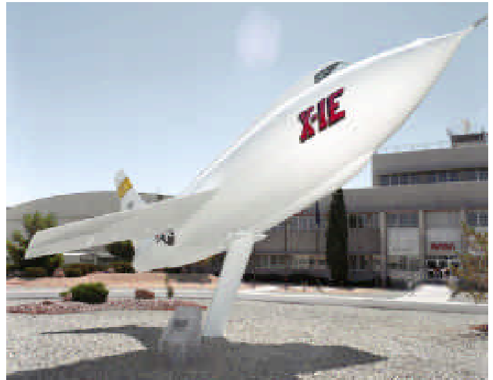
Photo EC88-0138-1. X-1E on display stand at Dryden.