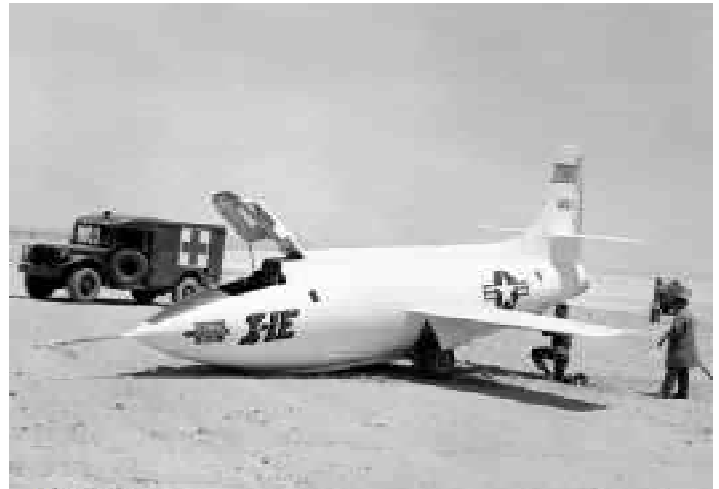
Photo E-2369. X-1E on lakebed with collapsed nose gear.

Once the modifications were completed, several months of ground tests were required before the aircraft could take flight. NACA research pilot Joe Walker was selected as project pilot. Walker made the first X-1E glide flight on Dec. 15, 1955. The XLR-11 engine and the turbopump had a number of problems which forced Walker to shut them down. The X-1E did not fly again until April 1956, but, despite some problems, it made good progress. On the X-1E's sixth flight, on June 7, Walker reached Mach 1.55, in what was the airplane's first supersonic flight since being