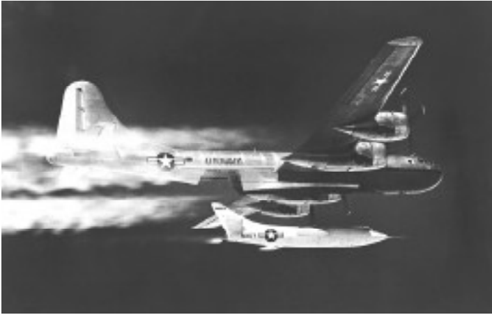
D-558-2 in flight.

was to investigate the flight characteristics of a swept-wing aircraft at high supersonic speeds. Particular attention was given to the problem of "pitch-up," a phenomenon often encountered with swept-wing configured aircraft. The D-558-2 was a single-place, 35-degree swept-wing aircraft measuring 42 feet in length. It was 12 feet, 8 inches