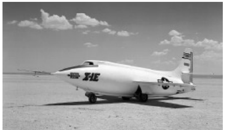
X-1E on lakebed.

The no. 2 X-1 was modified and redesignated the X-1E. The modifications included adding a conventional canopy, an ejection seat, a low-pressure fuel system of increased capacity, and a thinner high-speed wing.