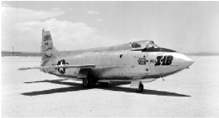
X-1B on lakebed. NASA photo E-4097.

The X-1B was fitted with 300 thermocouples for exploratory aerodynamic heating tests. It also was the first aircraft to fly with a reaction control system, a prototype of the system used on the X-15. The X-1C was cancelled before production.