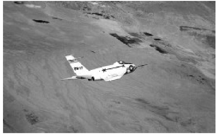
X-4 in flight.

The X-4, a single-place, swept-wing, semi-tailless aircraft was designed and built by the Northrop Aircraft Company for NACA. It had no horizontal tail surfaces and its mission was to obtain in-flight data on the stability and control of semi-tailless aircraft at high subsonic speeds. The two X-4 aircraft were 23 feet long, 14 feet high, and