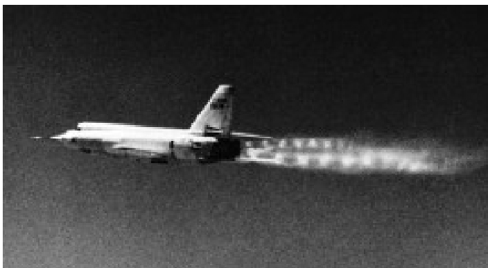
X-2 in flight.

The X-2 was a single-place airplane with wings swept back 40 degrees. It was 37 feet, 10 inches long (fuselage only); 11 feet, 9 inches high; and had a wingspan of 32 feet, 3 inches. It was constructed primarily of K-Monel (a nickel alloy) and stainless steel. It had an ejectable nose capsule.