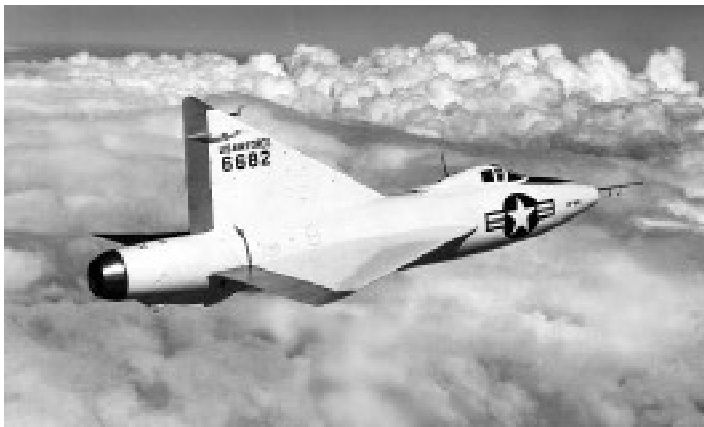
XF-92A in flight. NASA photo E-17346.

The XF-92A was this country's first delta-wing aircraft. It was flown to obtain data on the flight characteristics of a delta-wing aircraft in the transonic speed range.