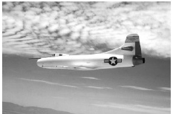
D-558-1 in flight. NASA photo E-713.

A single-place, straight-wing, jet-powered aircraft, the D-558-1 "Skystreak" was manufactured by Douglas Aircraft Company for a joint Navy/NACA flight research program. It was designed to investigate jet-aircraft characteristics at transonic speeds, including stability and control and buffet investigations.