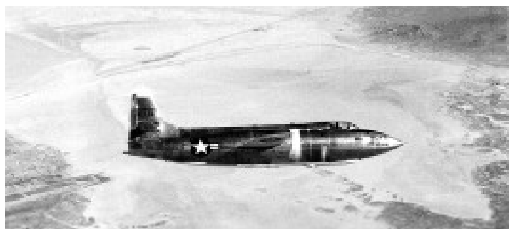
X-1A in flight over lakebed. NASA photo E-2490.

Their mission was to continue the X-1 studies at higher speeds and altitudes. The X-1A began this research after the X-1D was destroyed in an explosion on a captive flight