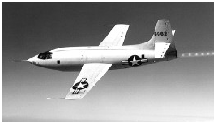
X-1-1 in flight in 1947.

that was built by the Bell Aircraft Company for the U.S. Air Force and the NACA. The mission of the X-1 was to