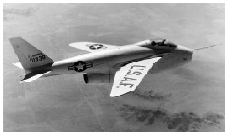
X-5 in flight.

Its mission was to study the effect of wing-sweep angles of 20 to 60 degrees at subsonic and transonic speeds. Results