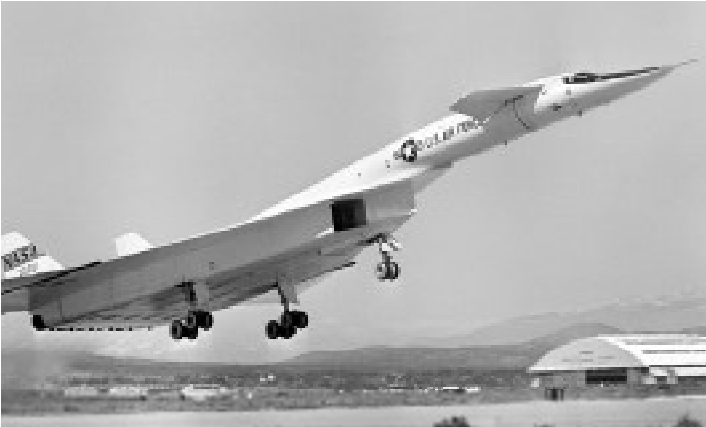
XB-70A taking off. NASA photo E-16695.

The XB-70 was the world's largest experimental aircraft. It was capable of flight at speeds of three times the speed of sound (roughly 2,000 mph) at altitudes of 70,000 feet. It was used to collect in-flight information for use in the design of future supersonic aircraft, military and civilian.