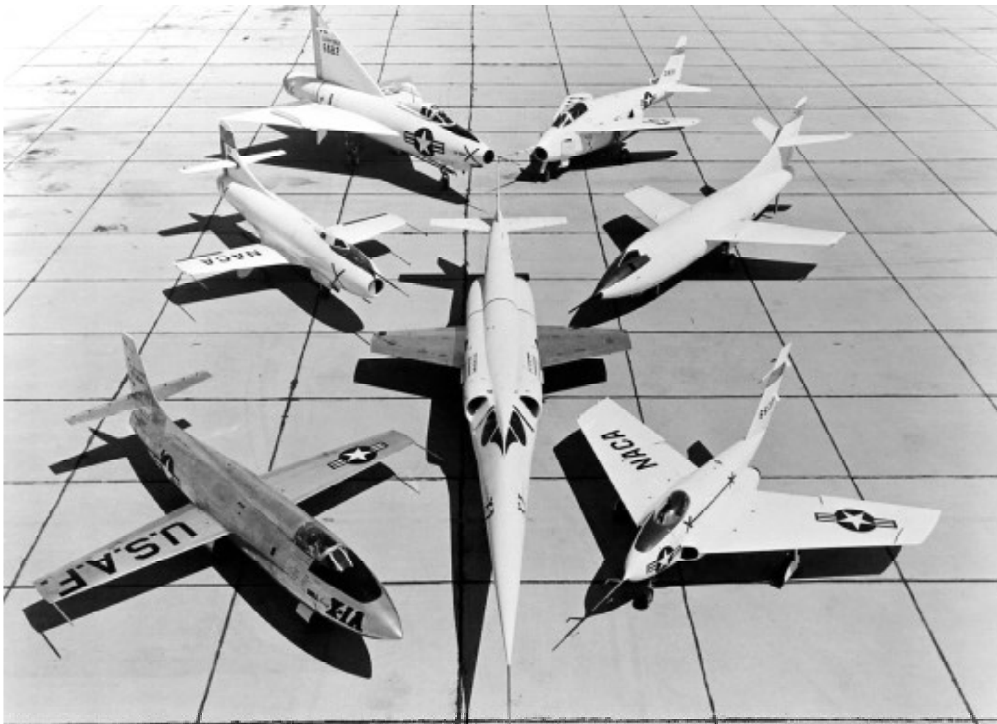
X-3 (center) and, clockwise from left: X-1A, D-558-1, XF-92A, X-5, D-558-2, and X-4.

The Research Airplane Program was a joint research effort by the National Aeronautics and Space Administration (NASA--formerly the National Advisory Committee for Aeronautics or NACA) and the military services. It was conceived near the end of World War II to perform flight studies with a series of specially-constructed research aircraft in the then-unexplored transonic to low-supersonic characteristics of full-scale aircraft in flight.