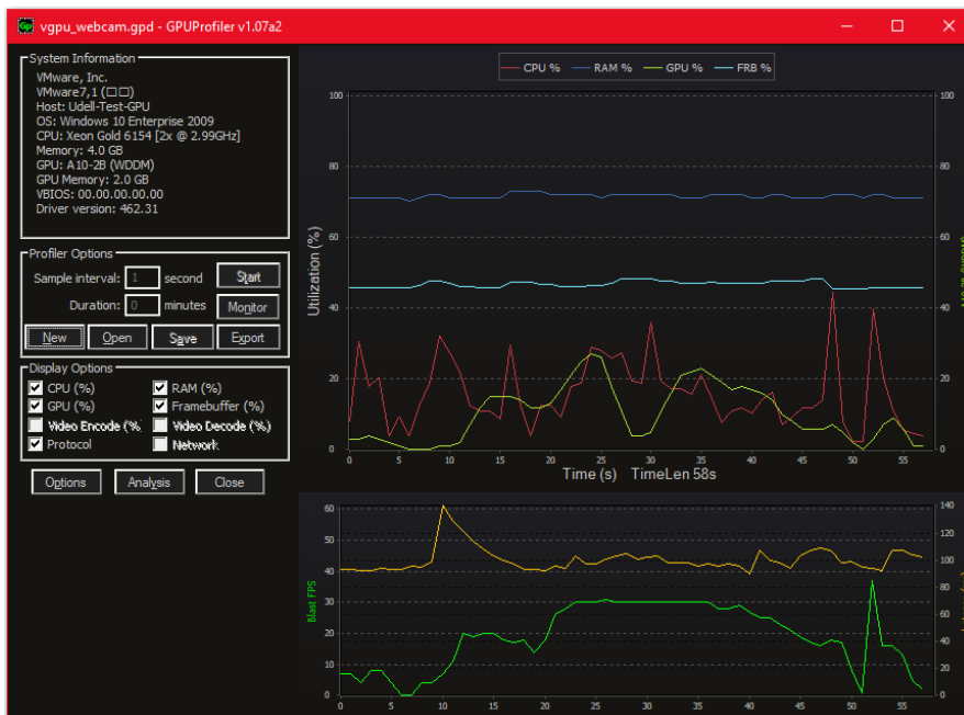
Figure 1. GPU Profiler Screen Capture

Figure 1 shows a screen capture of the GPU Profiler.