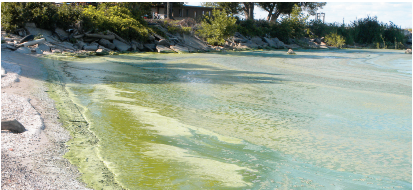
A toxic Microcystis bloom washes up on the shore of Maumee Bay in western Lake Erie on August 29, 2011.

In the Western Basin of Lake Erie, blooms of blue green algae called cyanobacteria can produce toxins that can kill fish, mammals, birds, and can cause human illness. Even non-toxic algal blooms can negatively impact Lake Erie, and create challenges for communities and businesses that live, work and recreate on the water. Cladophora blooms in the Central and Eastern Basin of Lake Erie, often referred to as nuisance algae, do not produce toxins, but can create oxygen dead zones, clog the gills of fish and invertebrates, clog