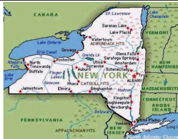
New York State, 2013