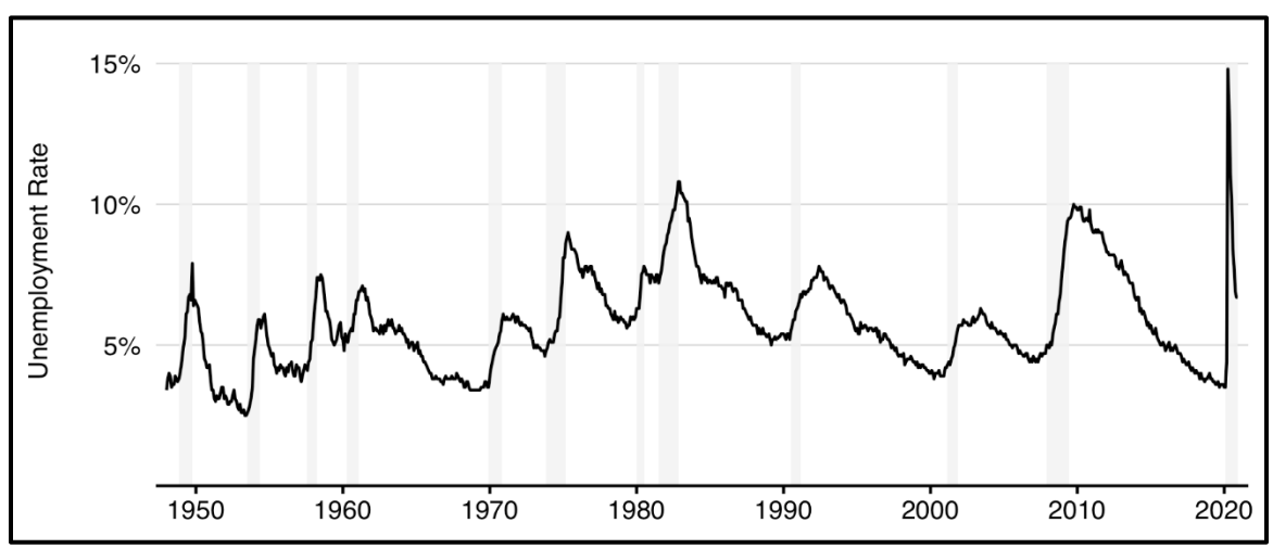
Figure 1: Historical Unemployment Rate <sup>6</sup> Seasonally-adjusted monthly data from January 1948 to December 2020

Note: Shaded regions in Figure 1 indicate recessionary periods as identified by the National Bureau of Economic Research