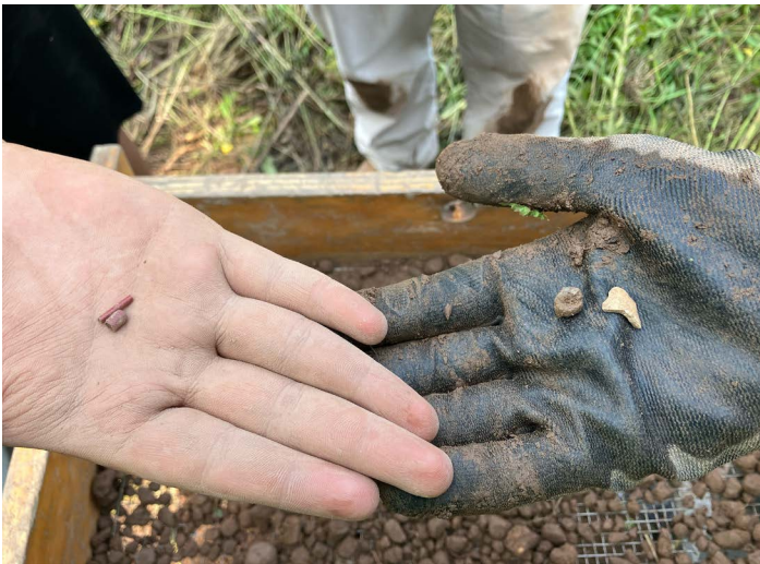
Beads, fragments of stone possibly used for tools and other artifacts were found during the Crew dig at a site in the Stockbridge area this summer.

In addition to some of the more manual work, the group attended Onyota'a:ká: language classes twice per week and visited Colgate University, the Great Swamp Conservancy and Nichols Pond, which was once home to an Oneida village.