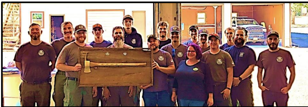
The Dalles Unit Receiving the 2023 "Golden Pulaski" safety award for their Pocket Guide submission.

District engagement and support for physical and mental well-being has long been a part of our culture but continues to grow. Our agency's partnership with Responder Life continues to benefit to our employees and led to the development of an agency Peer Support program. Central Oregon District has several employees who volunteer to be a valuable resource to our employees in their time of need.