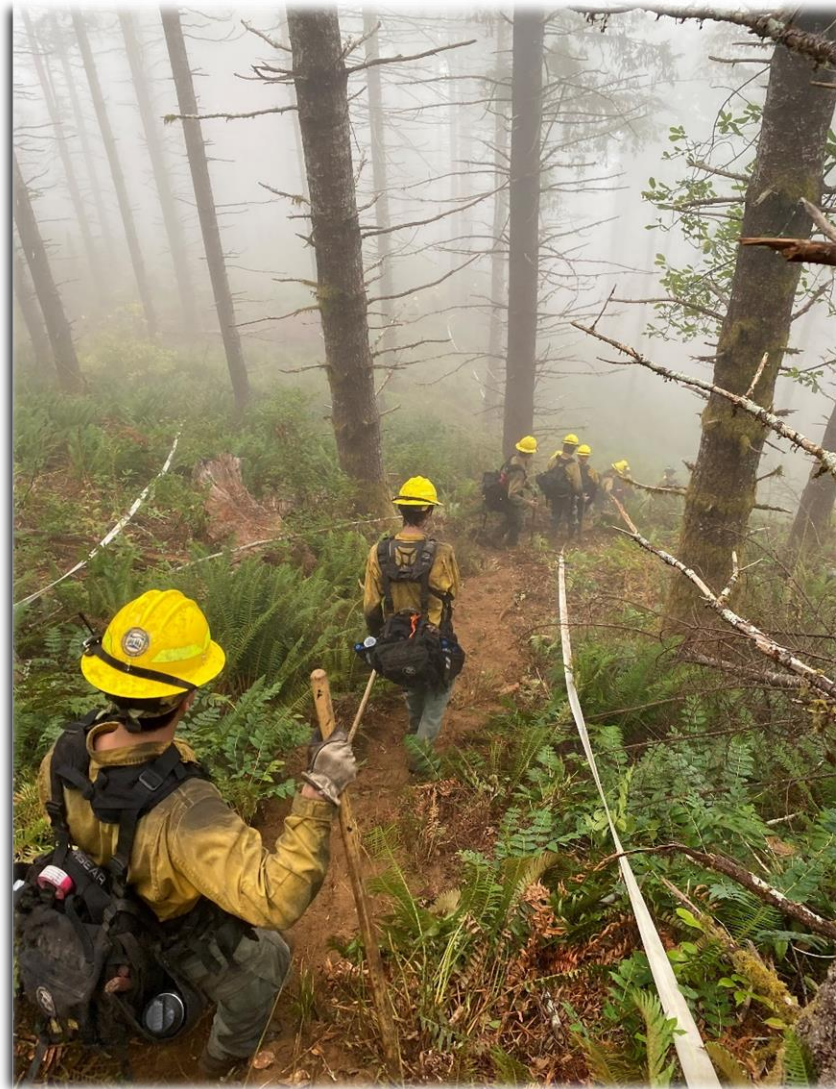
(The Dalles Fuels Crew on Hatchery Falls Creek Fire on West Oregon District)