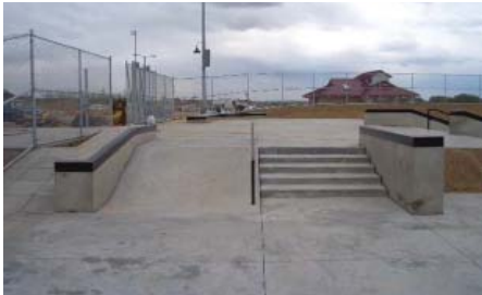
(A) Stair/ Bank combination with Handrail and hubba ledges