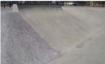
(B) Bank to curb