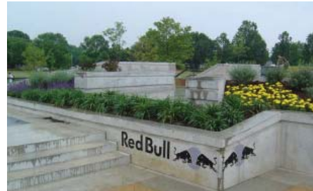
(E) Planter gap