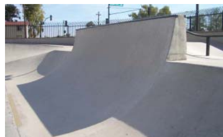
(G) Quarter pipe extension