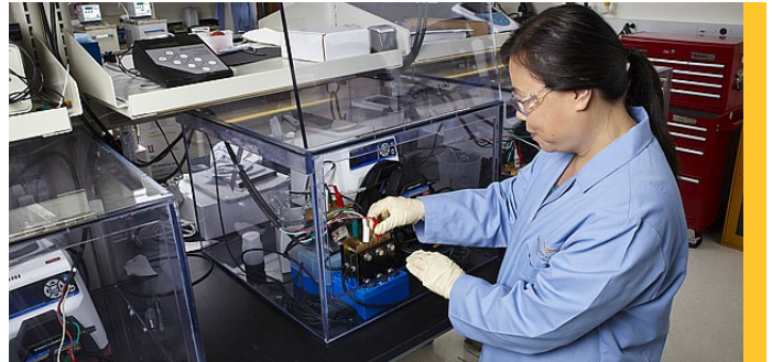
Redox flow batteries for a more reliable and secure power grid