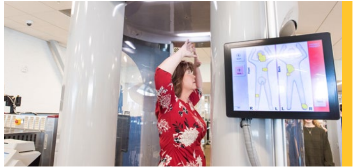
Airport scanners for safer travel