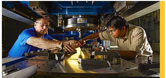
Light-weight material manufacturing for more fuel-efficient autos