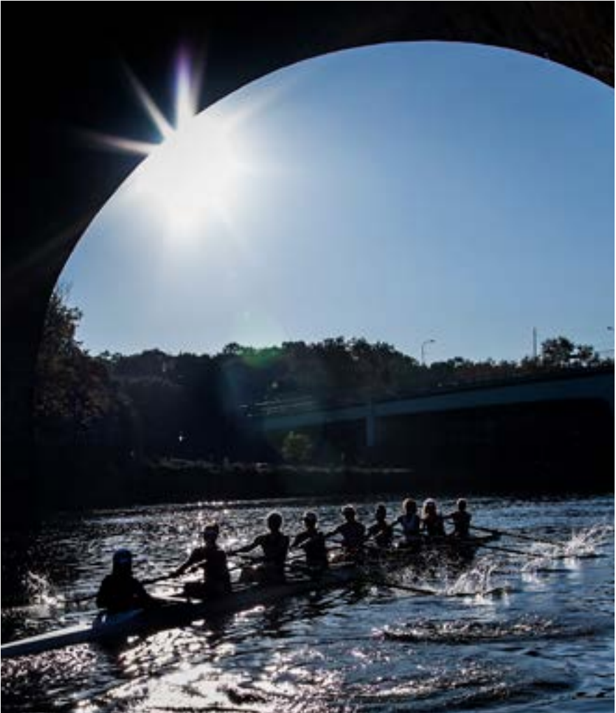
Penn Rowing

The Clery Act, as amended, requires separate statistics for specified criminal incidents, arrests and disciplinary referrals for certain non-contiguous properties. The following statistics include reportable crime at non-contiguous properties specified for inclusion in this report for the period January 1, 2019, through December 31, 2021. These statistics conform to the specific definitions, time period and classifications specified by federal law.