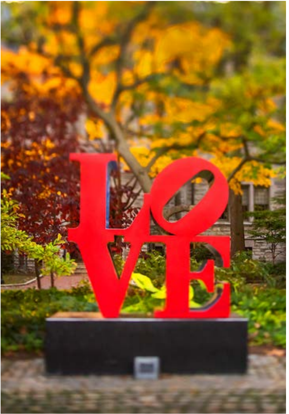
Love Statue