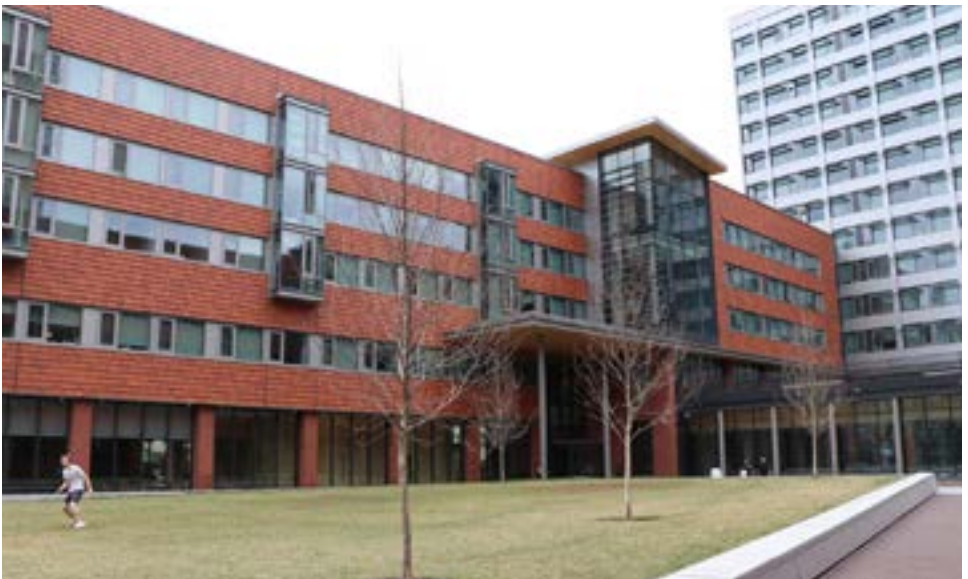
Gutmann College House

Public Property as “all public property that is within the same reasonably contiguous geographic area of the institution, such as a sidewalk, a street, other thoroughfare or parking facility, and is adjacent to a facility owned or controlled by the institution if the facility is used by the institution in direct support of, or in a manner related to the institution’s educational purposes.”