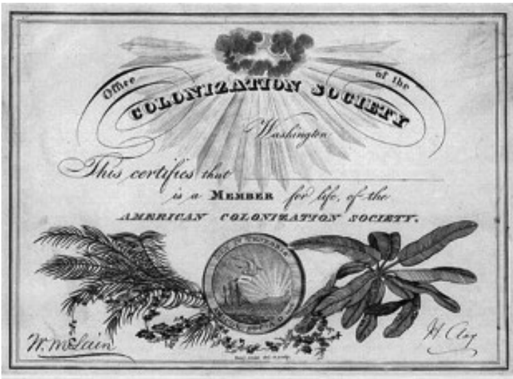
American Colonization Society Certificate