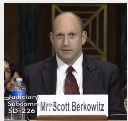
Taking Sexual Assault Seriously: The Rape Kit Backlog And Human Rights