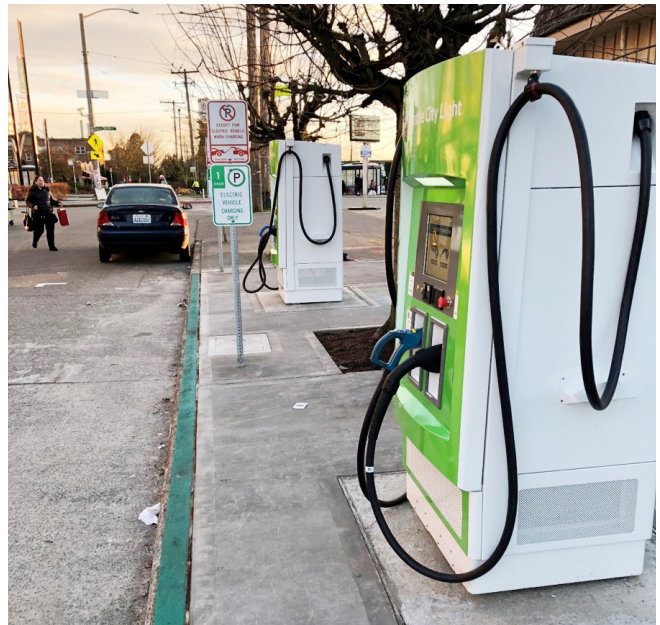
FIGURE 1. Seattle City Light's two Direct Current Fast Chargers located on the 2500 block of 16th Avenue S near the Beacon Hill Light Rail station.

This analysis is based on station data collected 5 from January 29th – December 31st, 2018 for the two Direct Current Fast Charging stations installed through EVCROW on the 2500 block of 16th Avenue S near the Beacon Hill Light Rail Station. Station usage increased by 18% over 2018 with an average of 3.2 charging sessions per day. While 260 drivers used the station, there were a handful of frequent users who appear to be using the stations as their primary charging point. For example, two return users charged their vehicles over 20 times in December 2018. This indicates that EVCROW may provide access to reliable charging for EV drivers who do not have access to at-home charging, though further research is needed to validate this assumption.