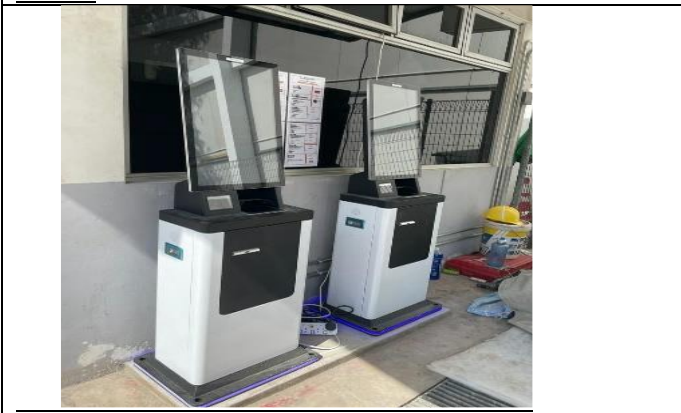
Registration kiosk near the security guardhouse at PPWC

ISSUED BY: Infrastructure Management Department Food Infrastructure Development and Management Division Singapore Food Agency