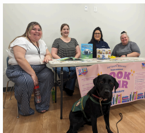
PetSense Book Fair