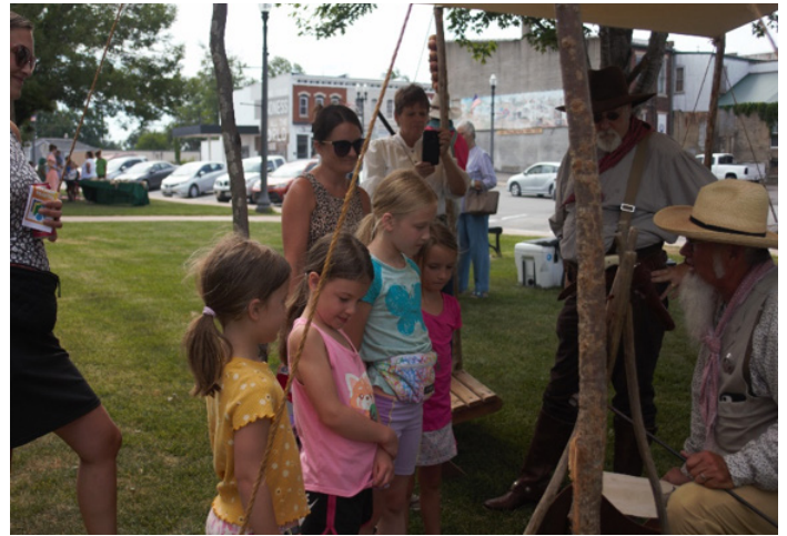
Young library patrons learn about chuckwagon cooking from a member of the South Forks Regulators.

To go along with its Missouri focus on the Adventure Begins in your Library summer programming theme, the Marion County Public Library recently offered its first Palmyra Heritage Day. Starting at the county courthouse, participants were able to interact with members of the South Fork Regulators, a historical reenactment group. They provided hands-on demonstrations related to life on the American frontier, including quilting, roping, chuck wagons, washboards and games for children. Participants could also tour the first log cabin built in Palmyra, the historic Gardner House built in 1828 and the Civil War era jail. Library books related to the era were also on hand and could be checked out. Approximately 100 community members participated in the event.