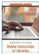
Demystifying Online Instruction in Libraries