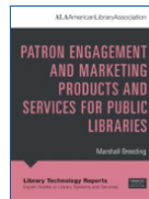
Patron Engagement and Marketing Products and Services for Public Libraries