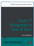
Library IT Management in Times of Crisis