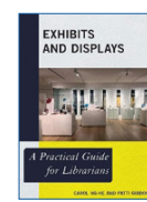
Exhibits and Displays: A Practical Guide for Librarians

Discover more of our new Library Professional Development titles as well as recorded webinars, government publications, and more on the Missouri Library Staff Guide .