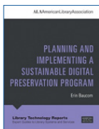
Planning and Implementing a Sustainable Digital Preservation Program