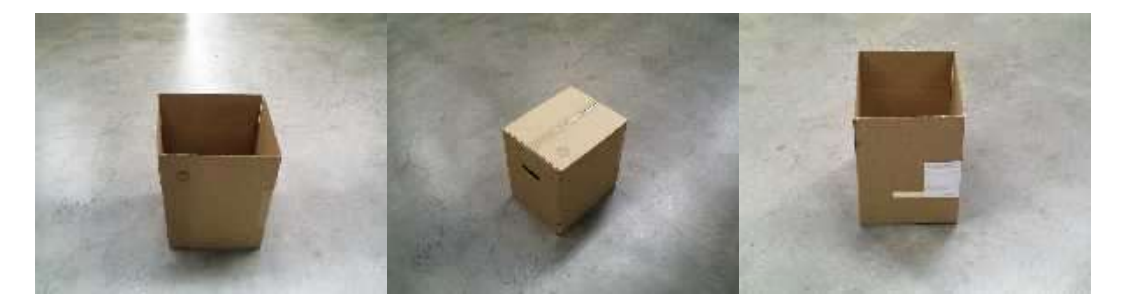
Figure 3: Example of cubic foot record storage box. The box is typically stored flat. From left: open box, tape bottom of box, ready to fill

<u>A note on storage boxes</u>: It is recommended that standard 10" x 12" x 15" boxes (i.e., cubic foot boxes) be used for record storage. These have fold-in flaps on the top and bottom and may have hand holes. The boxes require tape along the mid-line seam and can handle considerable weight. This style is the most economical option. They also save space and are easier to shelve in comparison to lidded, or banker's boxes. Banker's boxes with lids are much more expensive, the lids take up space—i.e., fewer boxes can be stored on a shelf, and it is inevitable that the lid will become dislodged and will be caught on shelves. In addition, boxes larger than one cubic foot are difficult to move when filled because of their weight and often buckle and collapse in the middle.