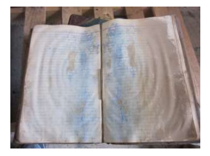
Figure 6: Record damaged during a flood

Water. Most record disasters involve water. Water damage to records occurs when storage areas flood, sewers back up, overhead water pipes break, or sprinkler systems or hoses are used to extinguish fires. When possible, do not store records under water pipes, and keep records at least 4 inches off the floor.