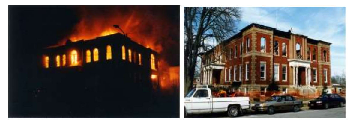
Figure 5: Mississippi County Courthouse, destroyed by arson, 1997

•Have fire extinguishers checked at regular intervals. Show staff where they are located and train staff to use them.