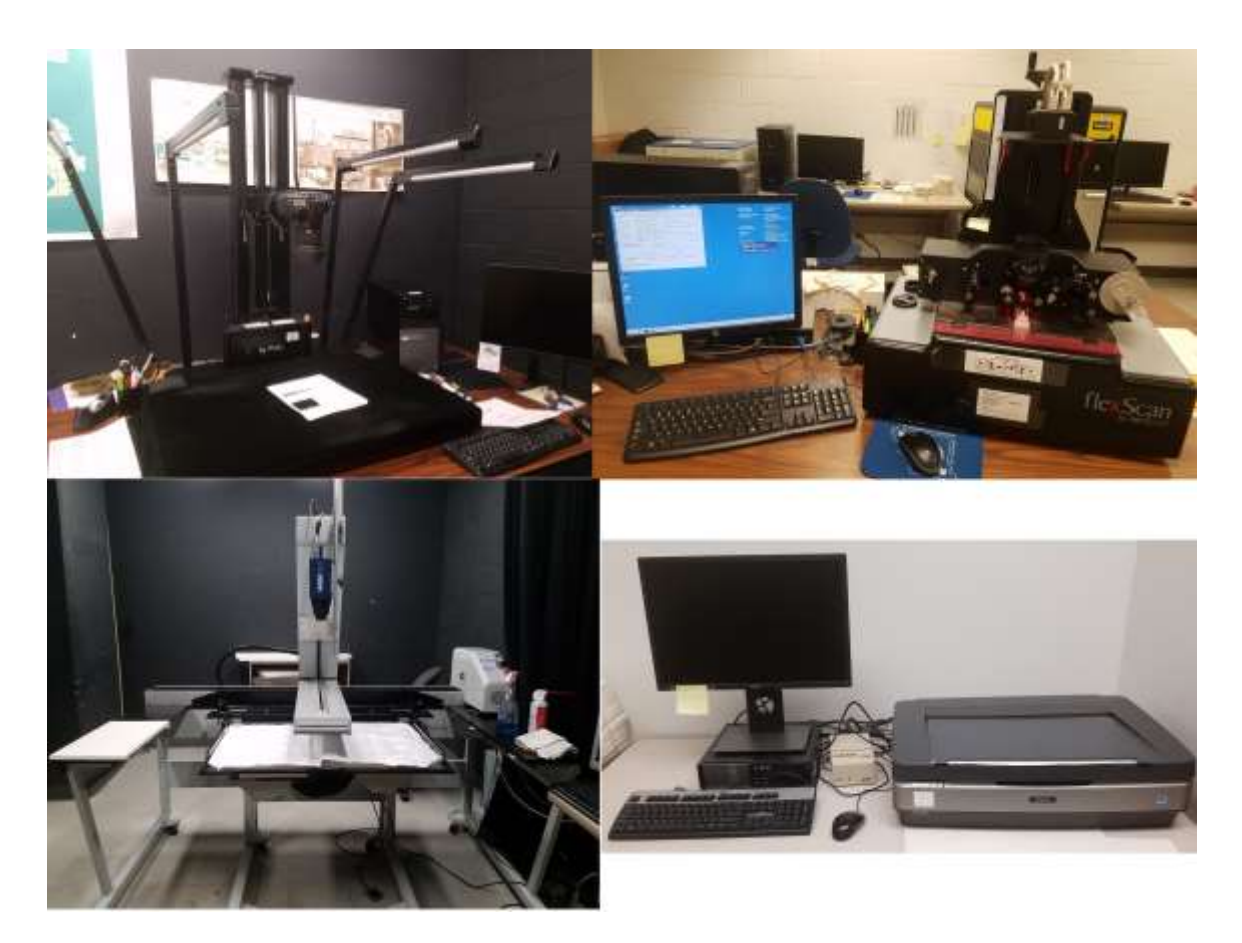
Figure 4: Metis scanner, microfilm scanner, large flatbed scanner, and a computer workstation with small scanner

If the records are going to be scanned in-house, there are file format standards that should be observed.