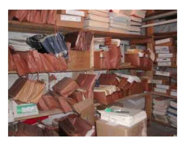
Figure 1: Poorly organized and/or unidentified records haphazardly thrown into a room and on shelves. How long would it take to find a given record in these circumstances? Records management should be an integral part of the daily routine of the office, conducted as a normal part of business.

So, what does bad records management look like?