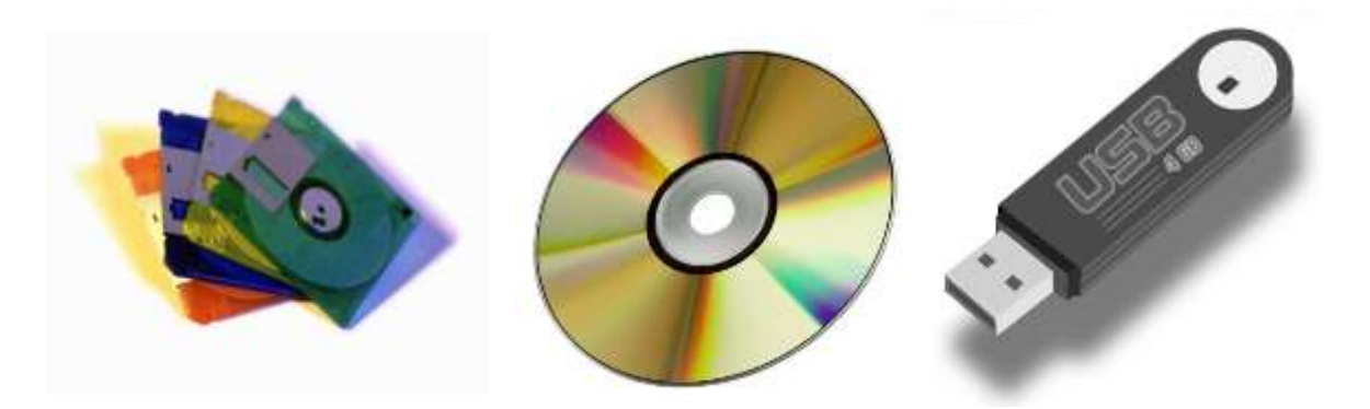
Figure 7: Typical office computer storage media

Hardware obsolescence—Floppy disks have been mentioned numerous times in this manual, but how many people actually have a working 3.5" floppy disk drive in their computer? How about 5.25"? DVDs have replaced CDs, and USB drives and external hard drives have become commonplace. What's next?