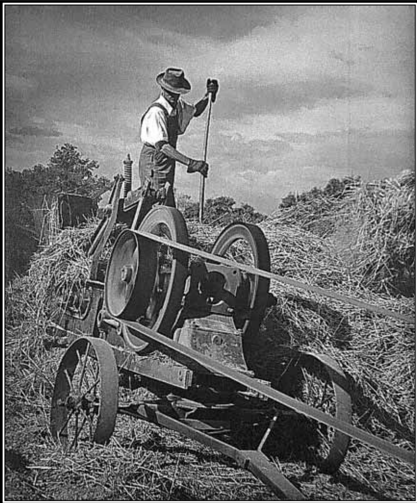
"The Hay Baler"