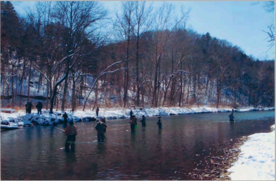
Trout Season