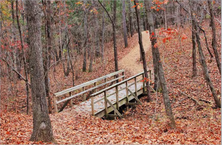
Bridge Photo courtesy of Missouri State Archives Publications Collection