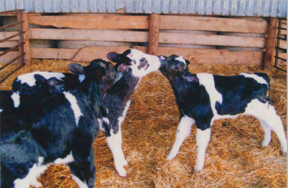
Calves in Marthasville