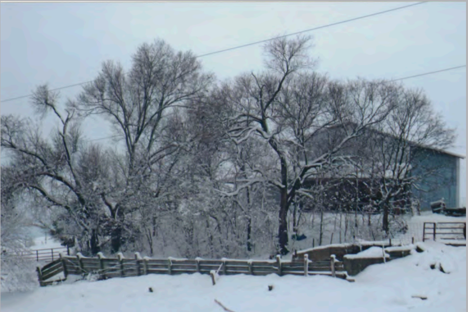
Fence and Barn in Winter