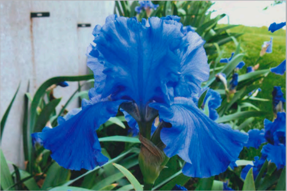
Blue Iris in Spring