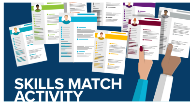
Figure 5: CSUDH's Skills Development and Student Engagement Activity