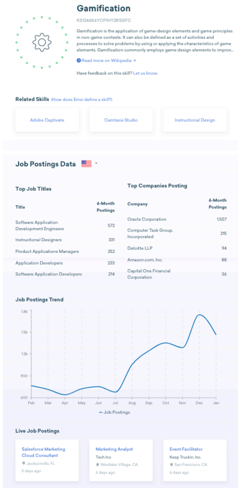
Figure 3: Emsi Skills Library Example (Gamification)