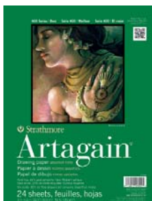
400 Series Artagain Assorted pad cover