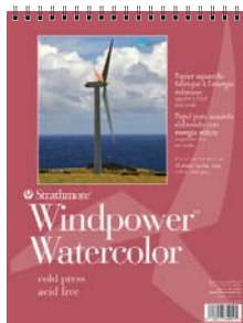
Windpower Watercolor pad cover