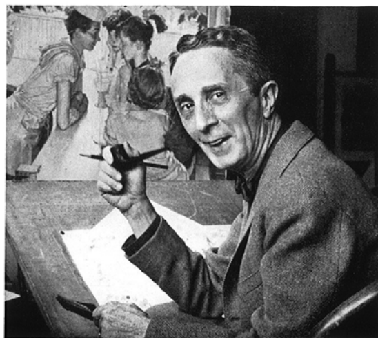
Prominent Artist Users of Strathmore: No. 143 of a Series

Advertisement from 1949 features student winners of Strathmore Scholastic Awards contest.