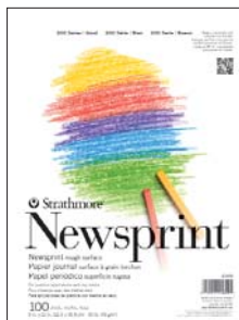
200 Series Newsprint pad cover