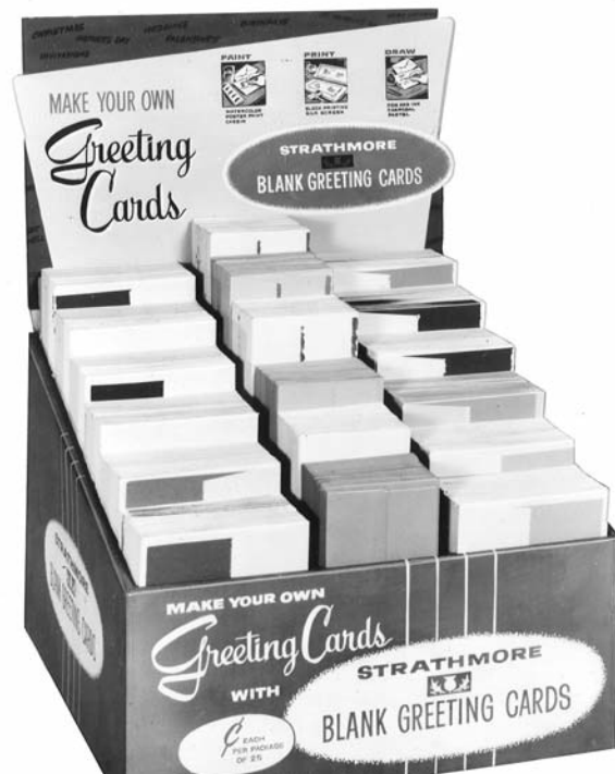
Above: Blank Greeting Cards were introduced in 1952. Below: Strathmore Blank Cards continue to be a favorite among artist and crafters.

Strathmore Paper Company, West Springfield, Mass.