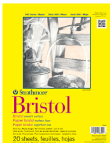
300 Series Bristol Smooth pad cover