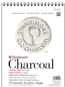
500 Series Charcoal pad cover