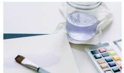
Never leave brushes soaking in water