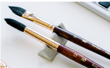
Don't rest your brush on its head

Paintbrushes are an investment, and one of the most important tools for an artist. That's why it's crucial to take care of them. When properly cared for, your brushes can last a long time and continue to perform beautifully.