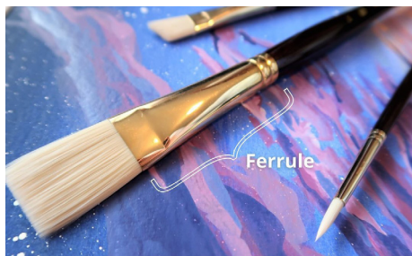
Keep the ferrule clean