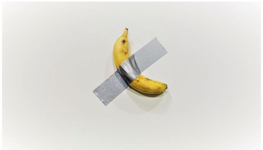
Comedian by Maurizio Cattelan

“ Creativity to me boils down to combinations. Combining two or more values to create a new value. I like to also think mathematically about creativity because it helps me create good formulas for each project. At the base of some of the most creative endeavors by great artists, they had a good source of inspiration which oftentimes are works by other artists, and you will always find striking combinations. Taping a banana to a wall can be seen as an act of creativity because there is a combination of two or more values, a banana, a tape, and a wall. Do you catch my drift? Imagine all the endless ideas that would be inspired by Maurizio Cattelan's artwork 'Comedian'. That's the base of creativity.”