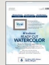
READY CUT WATERCOLOR Hot and Cold Press 3 Sizes for Readymade Frames

SHEETS: AQUARIUS II® Blend of Cotton & Synthetic Fibers GEMINI 100% Cotton 4 Deckle Edges IMPERIAL® Hot & Cold Press Harder Sized for Improved Lifting and Blending