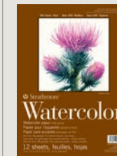
WATERCOLOR Heavyweight Professional Grade Cold Press