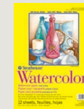
WATERCOLOR Heavyweight Cold Press