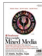
HEAVYWEIGHT MIXED MEDIA 3-ply Cotton Surface Extra Heavyweight