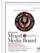
MIXED MEDIA In Sheets & Boards The Ultimate Surface for Mixed Media