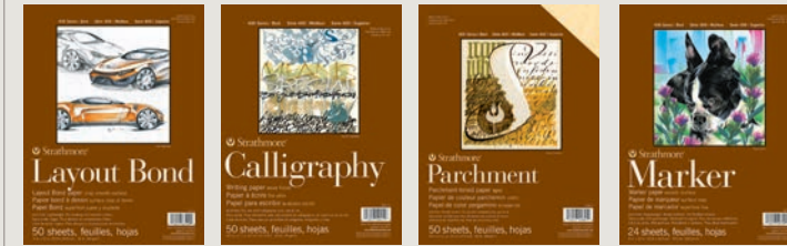
LAYOUT BOND Smooth Surface For Pencil, Pen, and Marker CALLIGRAPHY White For Calligraphy Nibs and Pen and Ink PARCHMENT Smooth Surface Available in White, Aged, and Natural MARKER Smooth Surface Heavyweight Bleed Resistant

Draw on Experience Best quality for advanced artists