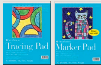
TRACING Semi-transparent MARKER Smooth Surface Bleed Resistant

Marker Paper is designed to accept heavy coverage and is bleed resistant.