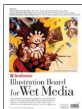
ILLUSTRATION BOARD FOR WET MEDIA For Drawing and Wet Media Applications