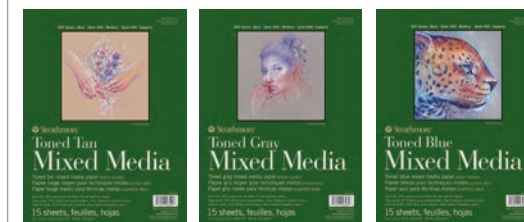
TONED MIXED MEDIA Heavyweight Medium Surface For Light and Dark Media