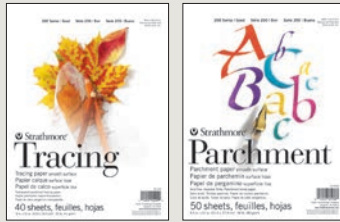
TRACING Smooth Surface Economical PARCHMENT Smooth Surface for Even Ink Flow

Let the World See Your Vision High value pads - customizable covers