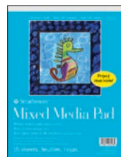
MIXED MEDIA Lightweight Vellum Surface

Combines the wet media performance of watercolor paper with the vellum finish of a drawing sheet. For graphite, colored pencil, sketching stick, pen and ink, pastel, marker, and collage. Also suitable for light washes in watercolor, gouache, or acrylic.