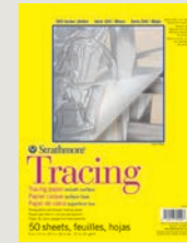
TRACING Smooth Surface Accepts Pencil, Marker, and Ink

Discover the Difference Better quality for developing artists