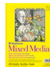
MIXED MEDIA Medium Weight Vellum Surface