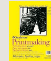
PRINTMAKING Lightweight Ready-to-Frame Sizes

500 Series 100% cotton and can be soaked for a wide array of printmaking techniques.