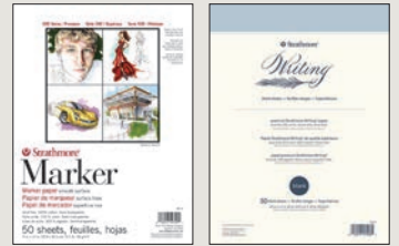
MARKER Smooth Surface Semi-Transparent WRITING 25% Cotton Fiber For Pen and Ink Correspondence

Create a Legacy Professional grade archival paper