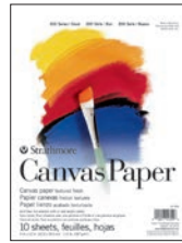
CANVAS Canvas Texture For Oils and Acrylics

Palette paper is a smooth coated sheet for blending and mixing oil and acrylic paint.