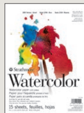
WATERCOLOR Lightweight Cold Press