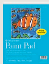
PAINT PAD Textured Also Good for Markers & Poster Paints

Paper manufactured to accept watercolor washes, lifting, and blending techniques.