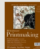
PRINTMAKING Heavyweight Sheet Stock and Ready-to-Frame Sizes