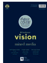
VISION MIXED MEDIA Medium Weight Vellum Surface