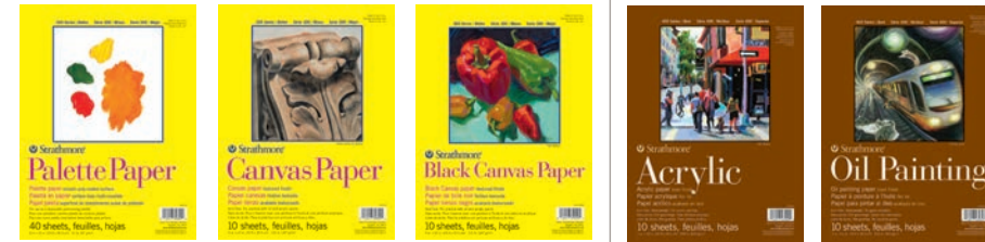
PALETTE Poly-Coated Disposable CANVAS Canvas Texture For Oils and Acrylics BLACK CANVAS Canvas Texture For Oils and Acrylics ACRYLIC Heavyweight Linen Texture OIL PAINTING No Gesso Required Linen Texture