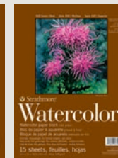
WATERCOLOR BLOCK Heavyweight Professional Grade Cold Press