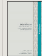
TRAVEL SERIES Pads and Journals For Urban Sketching & Plein Air Painting