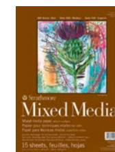
MIXED MEDIA Heavyweight Vellum Surface