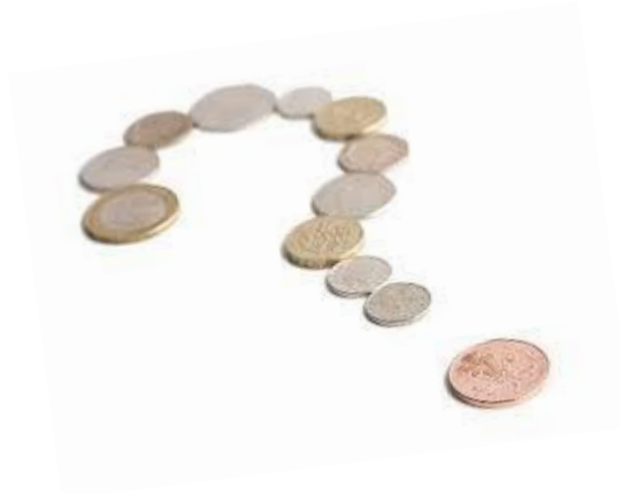
Table Tennis England do not make any charge and do not receive any of the admin fee.

If you are in a paid role then the charge is £36 plus the administration charge and £6.85 + VAT for the identity verification - all payable at the Post Office.