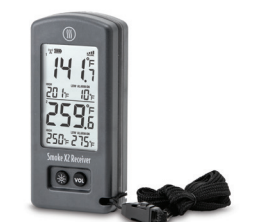
Spare Smoke X2™ Receiver A ruggedized receiver device to be paired directly to Smoke X2's base unit with audible alerts. Model #TX-1701-XX

Go to www.thermoworks.com/smokex for additional product information and more tips for use.