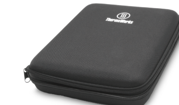
Large Zippered Storage Case Zippered storage case designed to store all of your favorite thermometers and probes. Dimensions: 8" x 9.5" x 2" Model #TX-1010X-SC