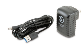
AC Adapter Optional AC Adapter for Smoke X2. Model # TX-1012X-SA

Cable Extension Extend your Pro-Series probes' cable an extra meter with this durable cable designed to keep your readings accurate. Model #TX-1008X-PX