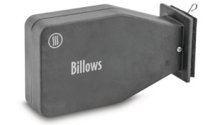
Billows™ BBQ Temperature Control Fan Eliminate vent adjustments and take control of the temperature in your smoker. Model #TX-1600