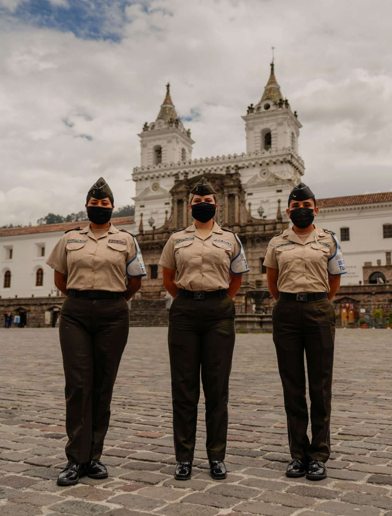
Quito, Pichincha.