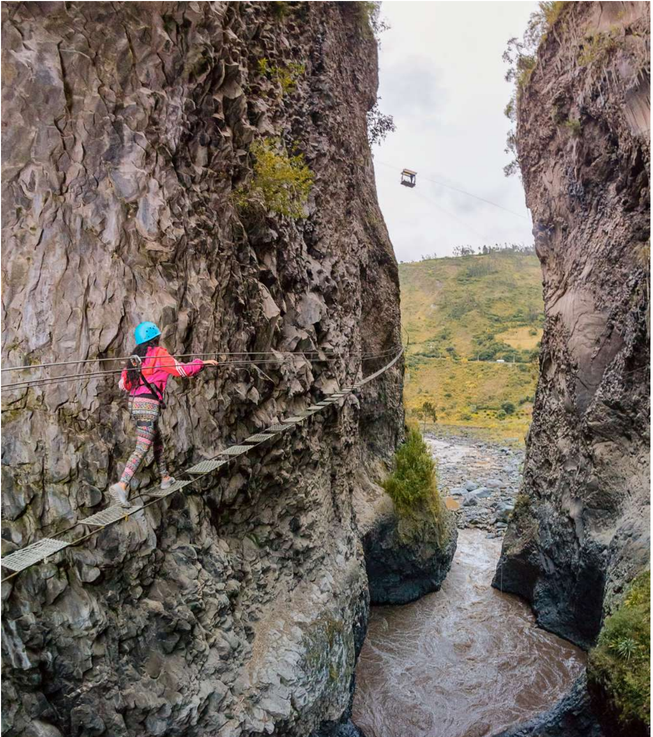
Baños, Tungurahua.