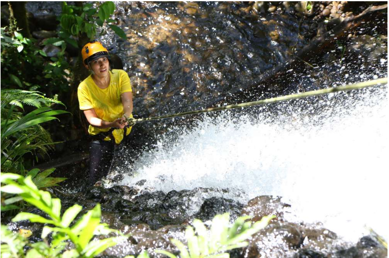
Puyo, Pastaza.