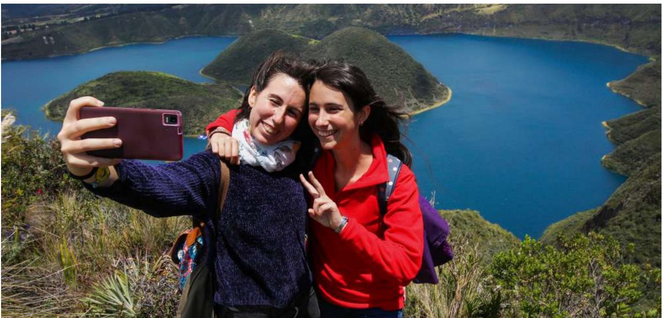
Cuicocha, Imbabura.