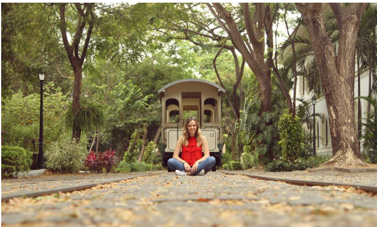
Guayaquil, Guayas.