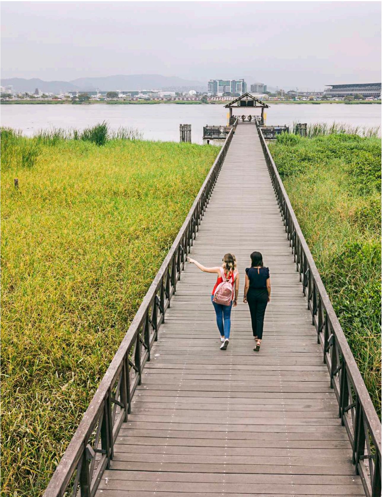
Guayaquil, Guayas.

This guide contains helpful travel recommendations for women and vulnerable groups that visit the country for tourism, and its objective is to provide adequate information that allows tourists to make the best decisions before and during their stay in Ecuador, ensuring that their trip is enjoyable.