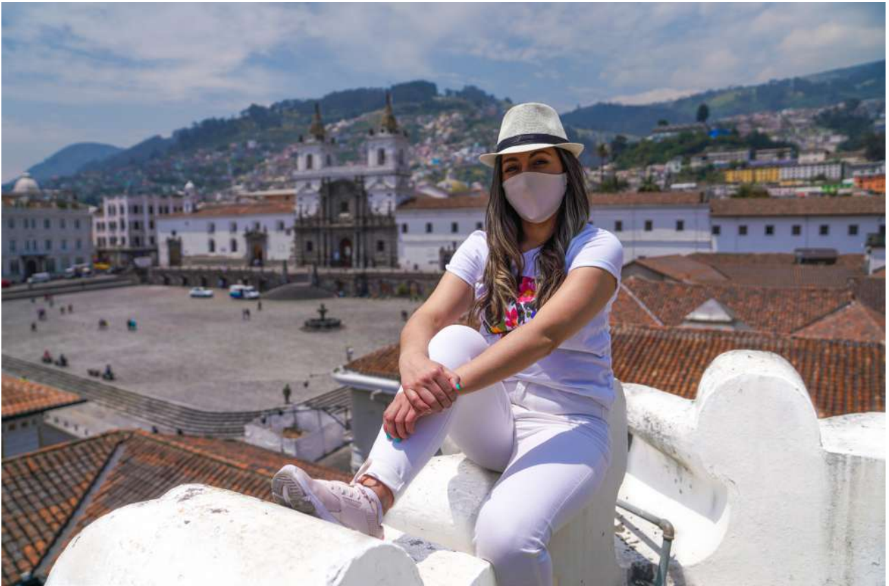
Quito, Pichincha.