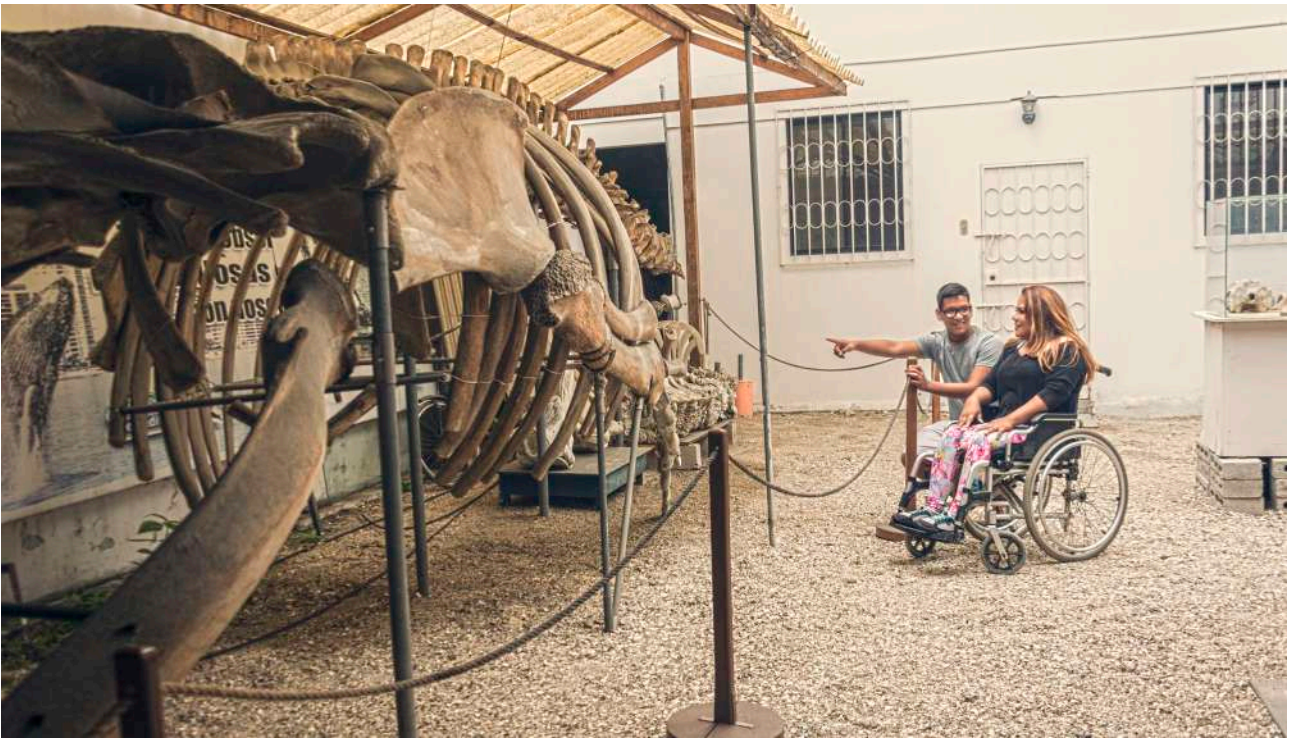
Salinas, Santa Elena.