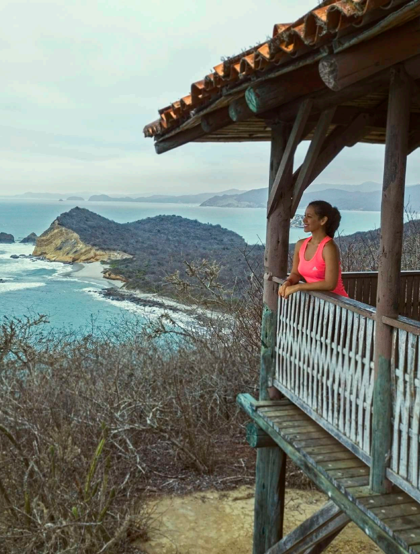
Machalilla, Manabí.