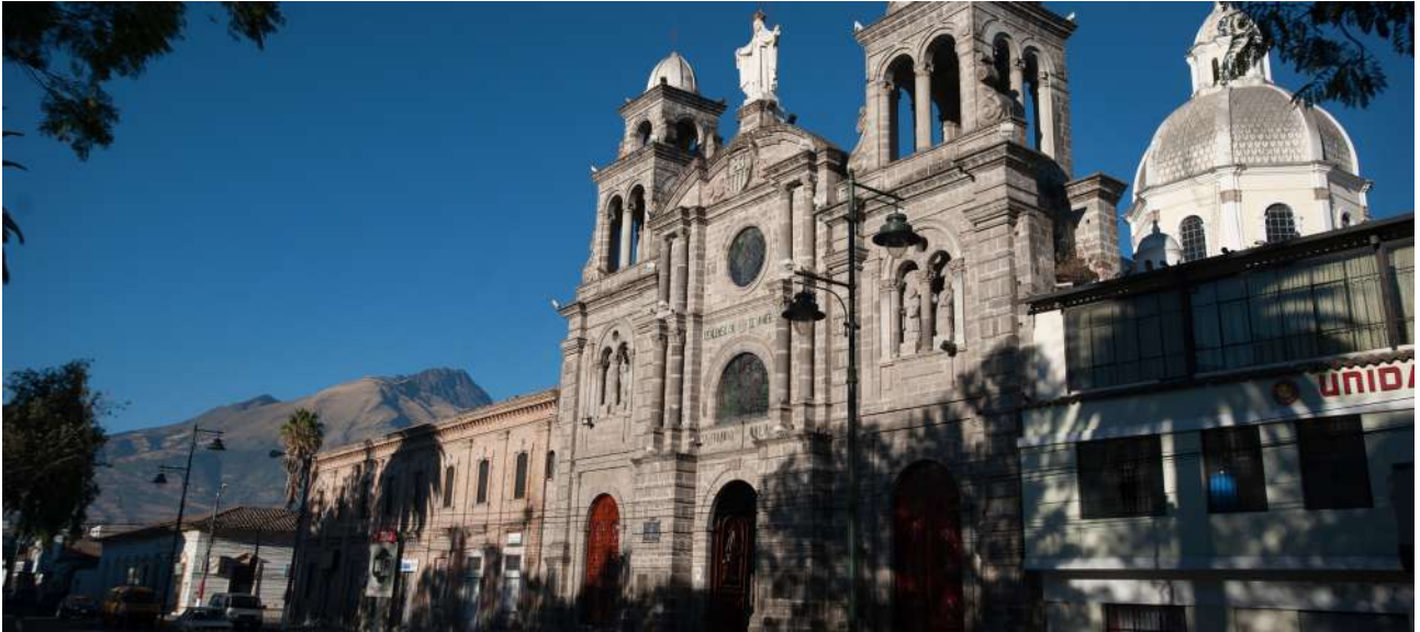
Ibarra, Imbabura.