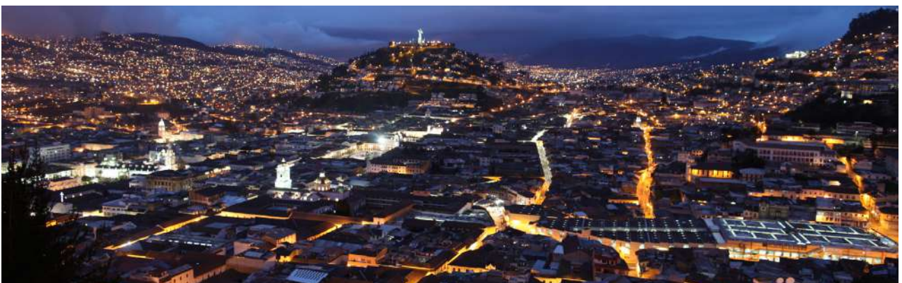
Quito, Pichincha. Photo: Ministerio de Turismo.