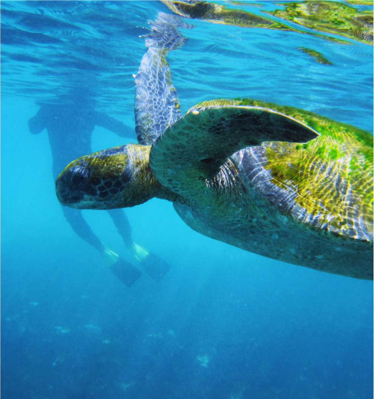
Galapagos Islands.