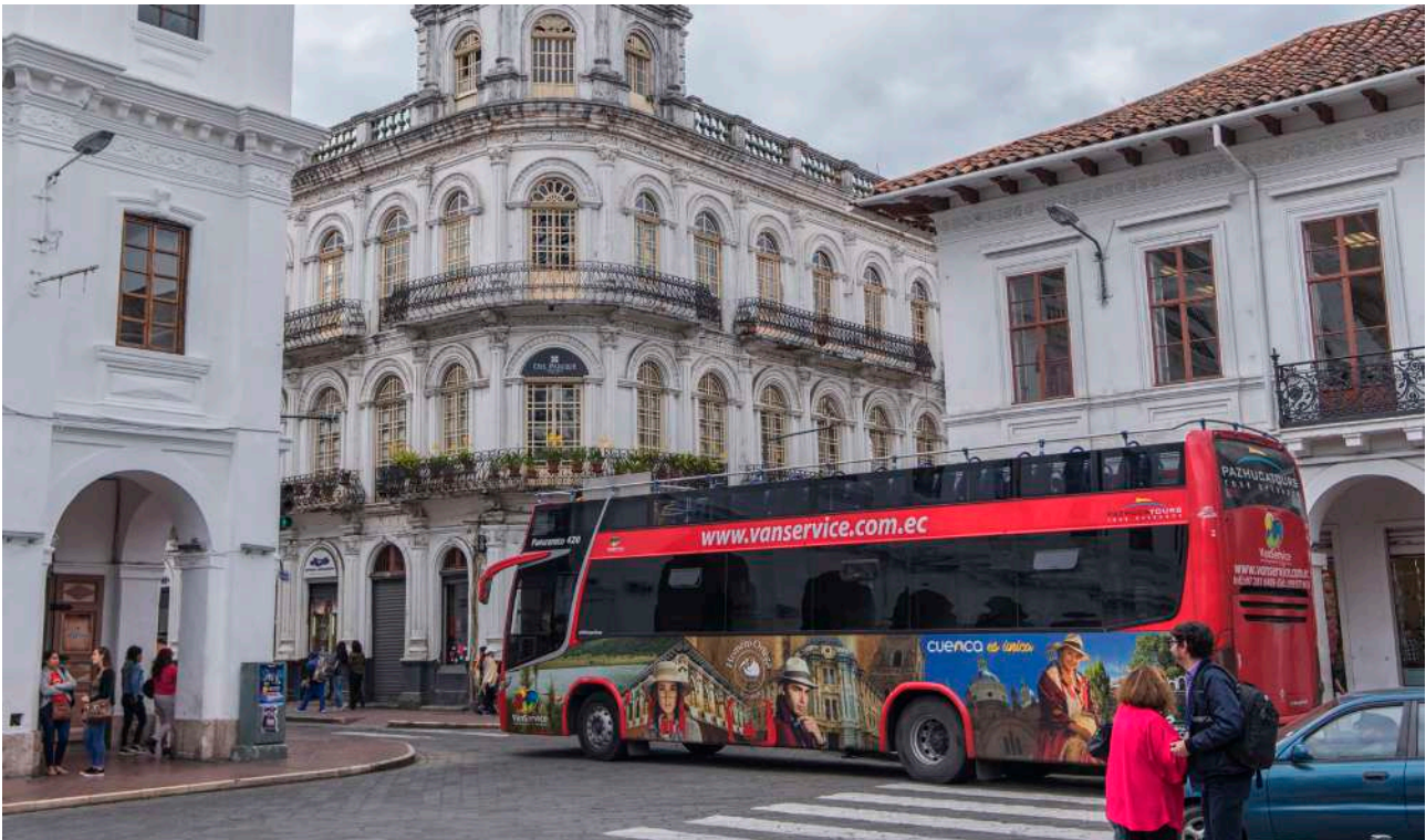
Cuenca, Azuay.