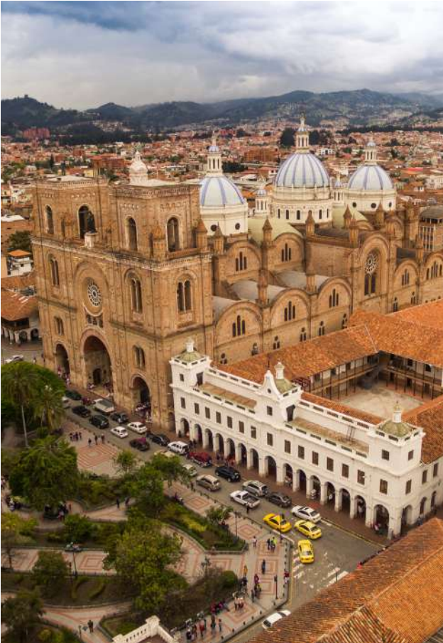
Cuenca, Azuay.