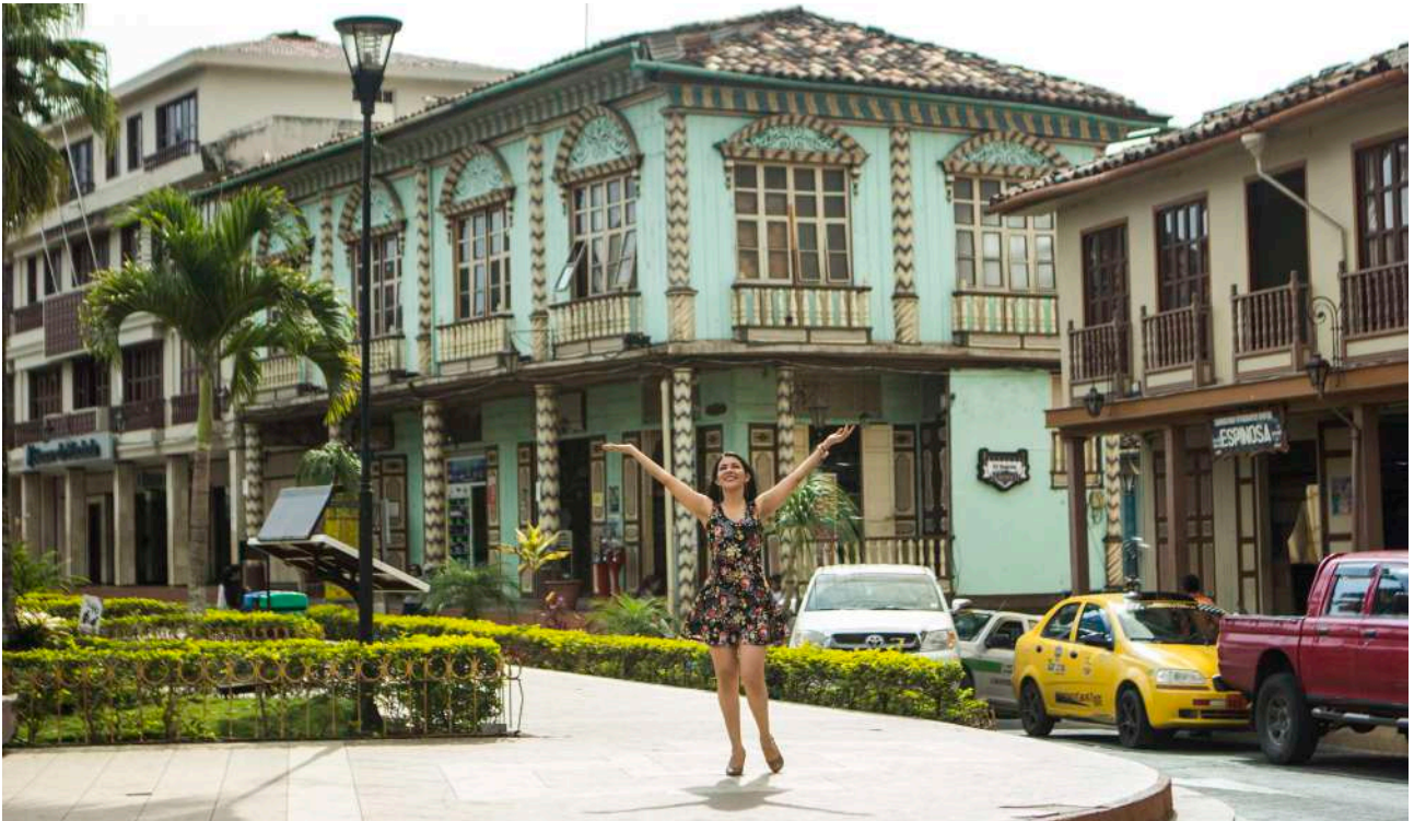
Zaruma, El Oro.