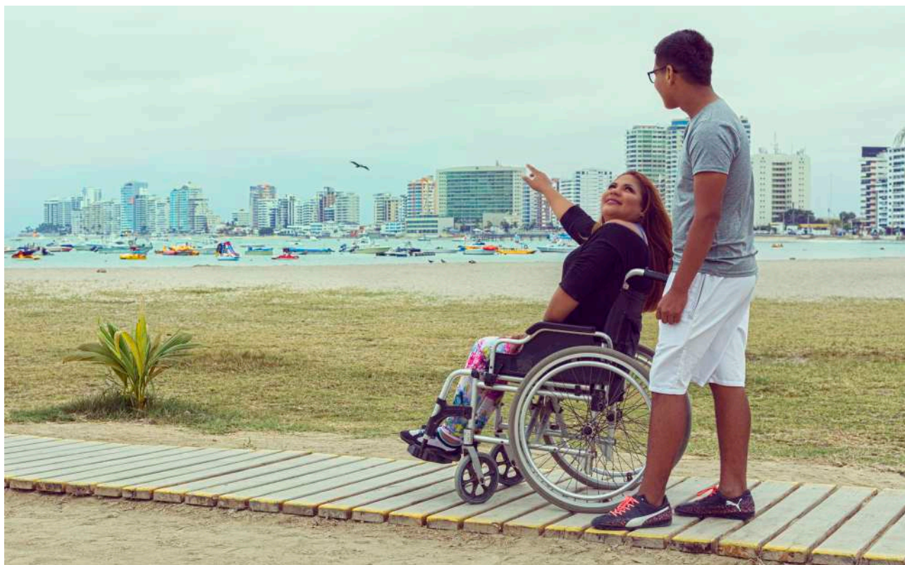
Salinas, Santa Elena.