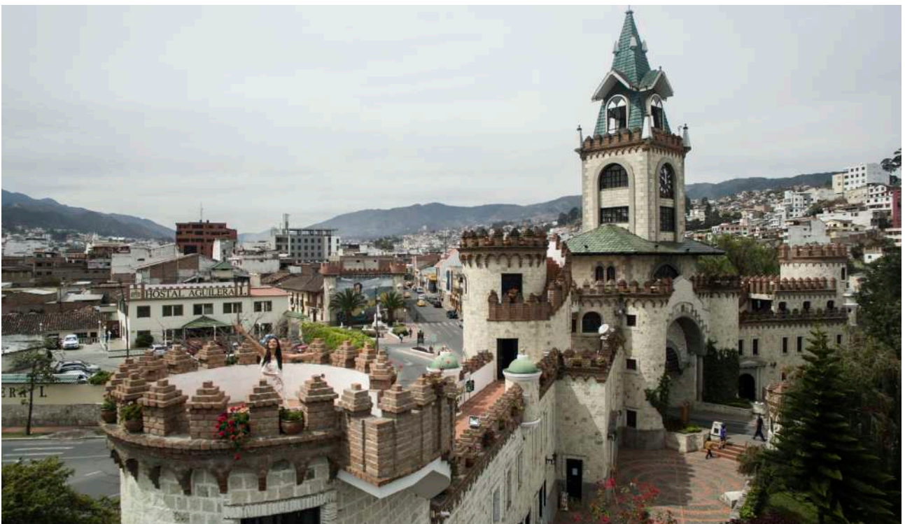
Loja, Loja.