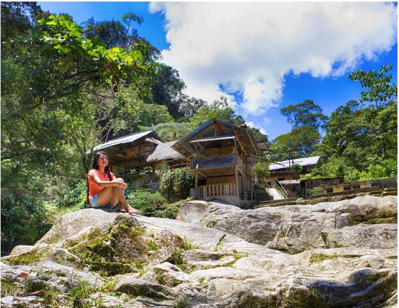
Tena, Napo.