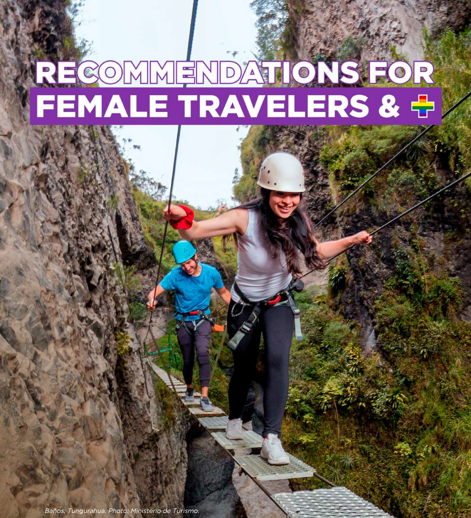
Baños, Tungurahua.