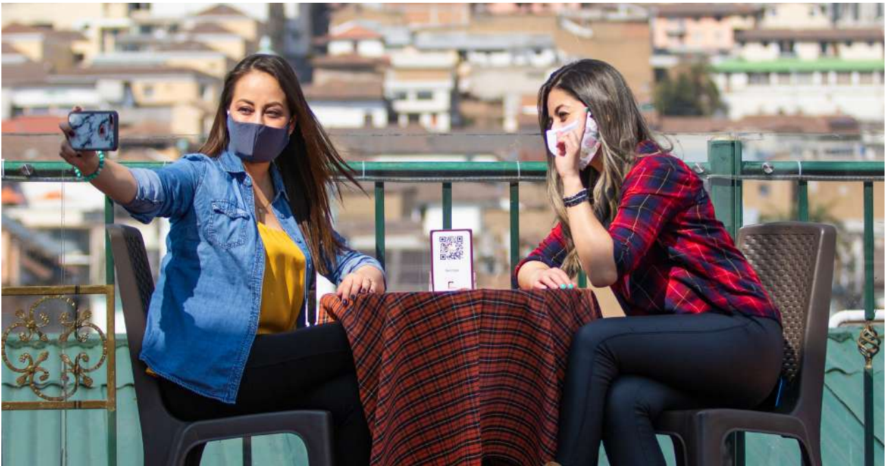
Quito, Pichincha.