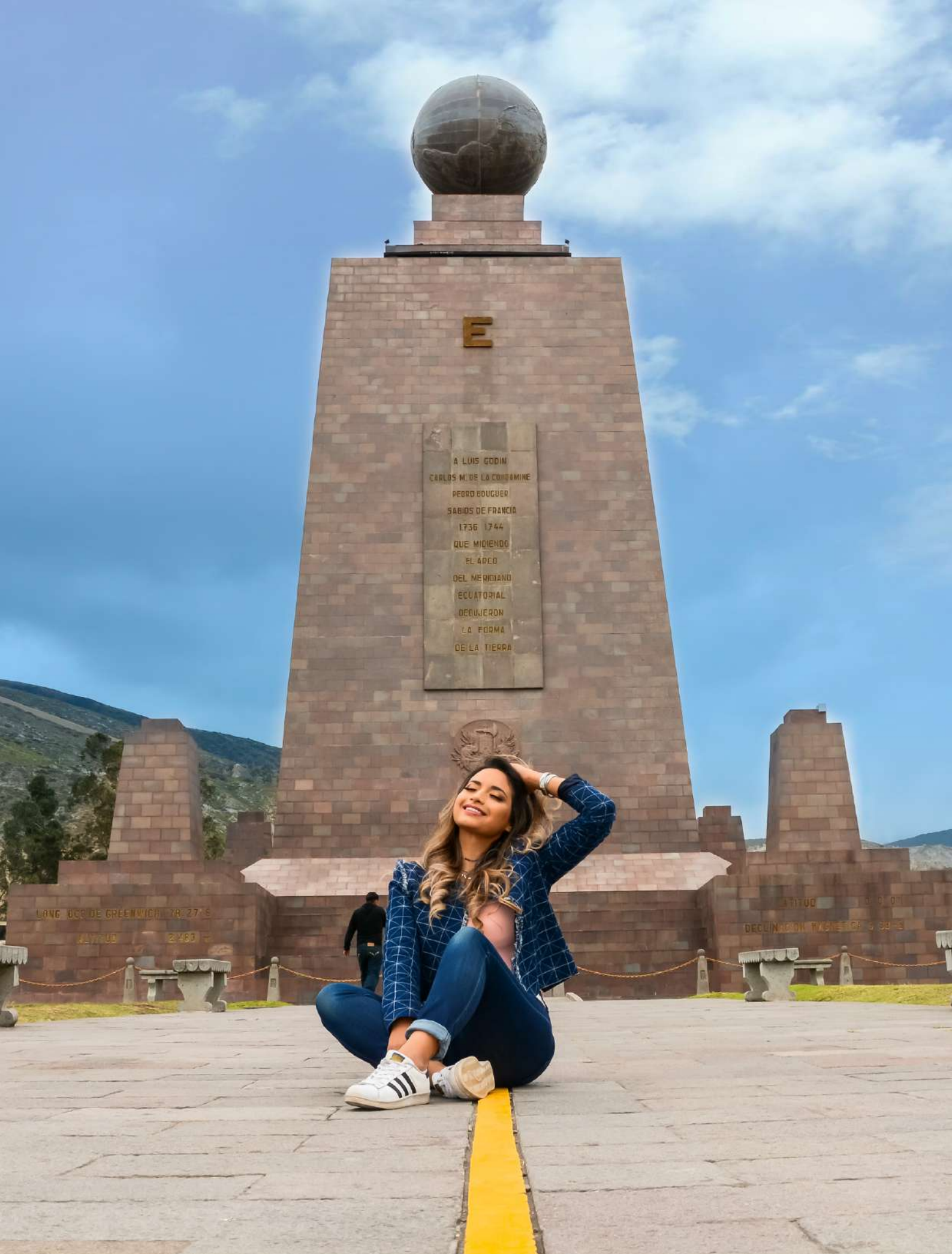
Mitad del Mundo, Pichincha.