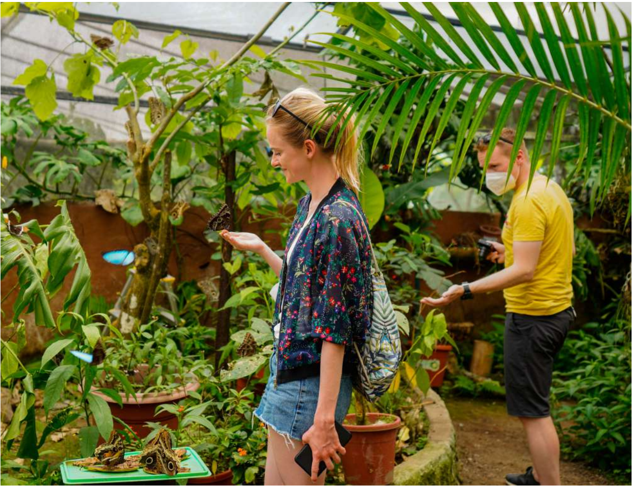
Mindo, Pichincha.