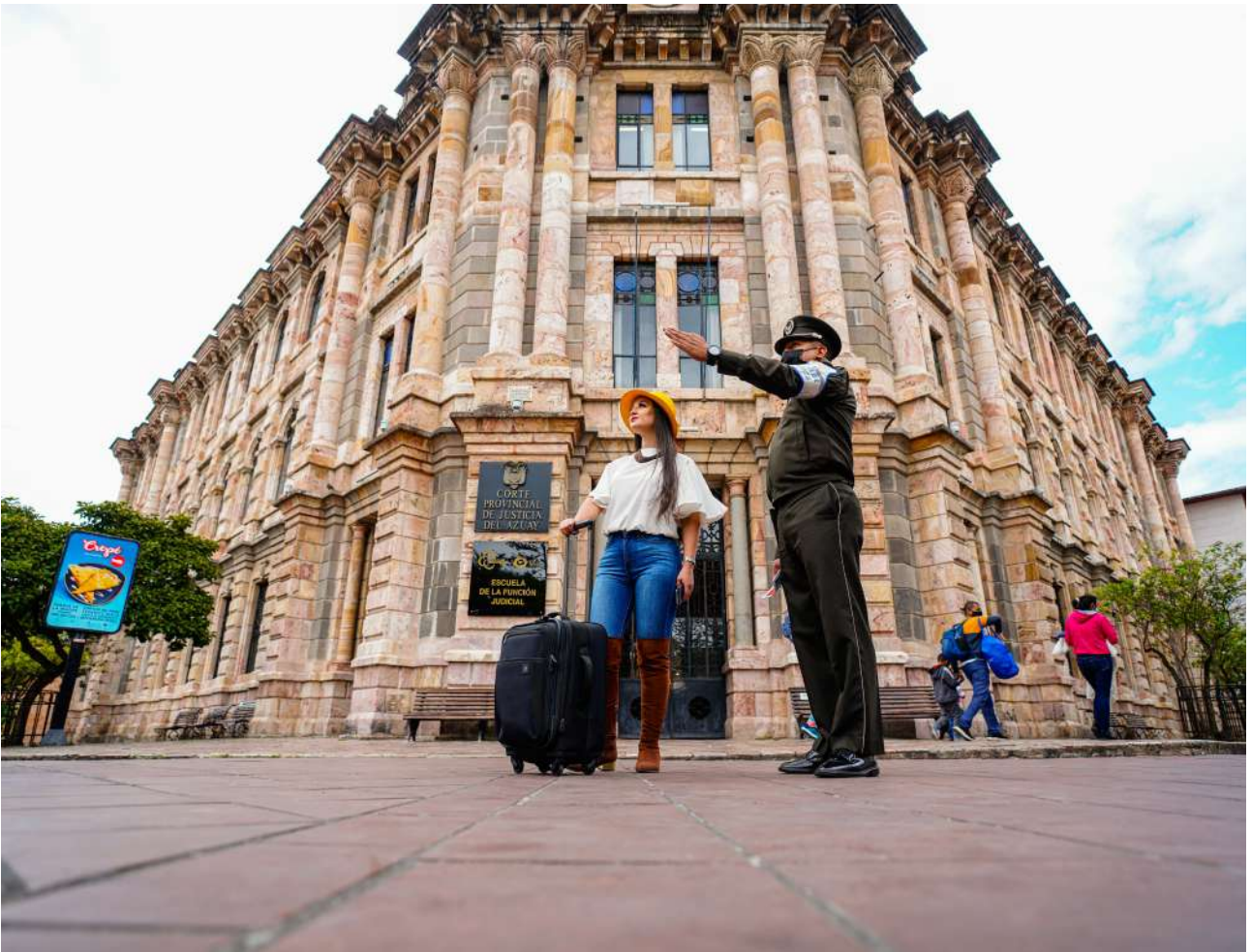
Cuenca, Azuay.