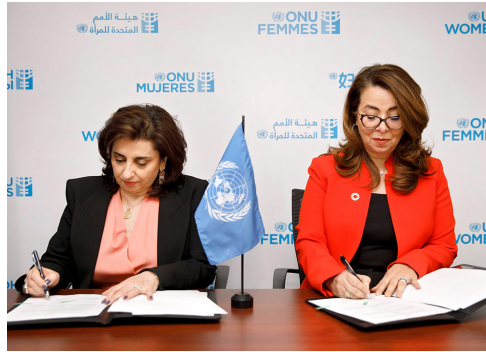
UN Women Executive Director Sima Bahous and UNODC Executive Director Ghada Waly.