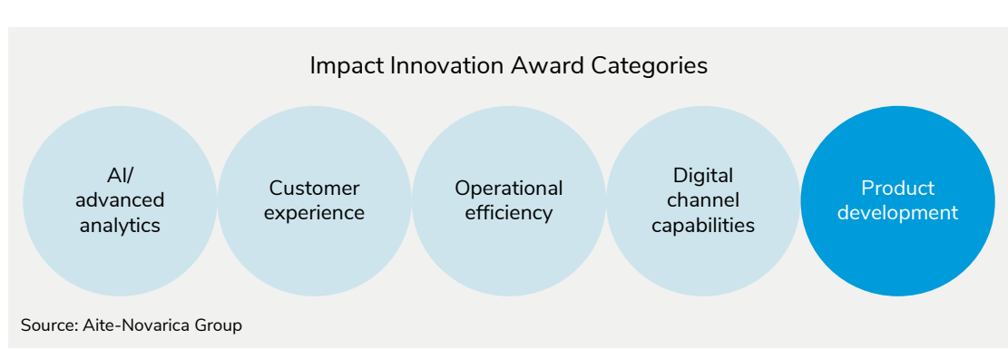
FIGURE 1: IMPACT INNOVATION AWARD CATEGORIES IN CASH MANAGEMENT AND PAYMENTS

U.S. Bank is the recipient of Aite-Novarica Group's 2021 Impact Innovation Award for Product Development (Figure 1).