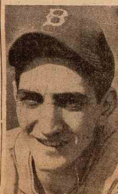
Ralph Branca, Dodgers.

SPORTSMAN PARK, St. Louis, Oct. 1.—Unprecedented in the 71 years of major baseball competition, which began with the organization of the National League in 1876, a postseason play-off series of three games for the