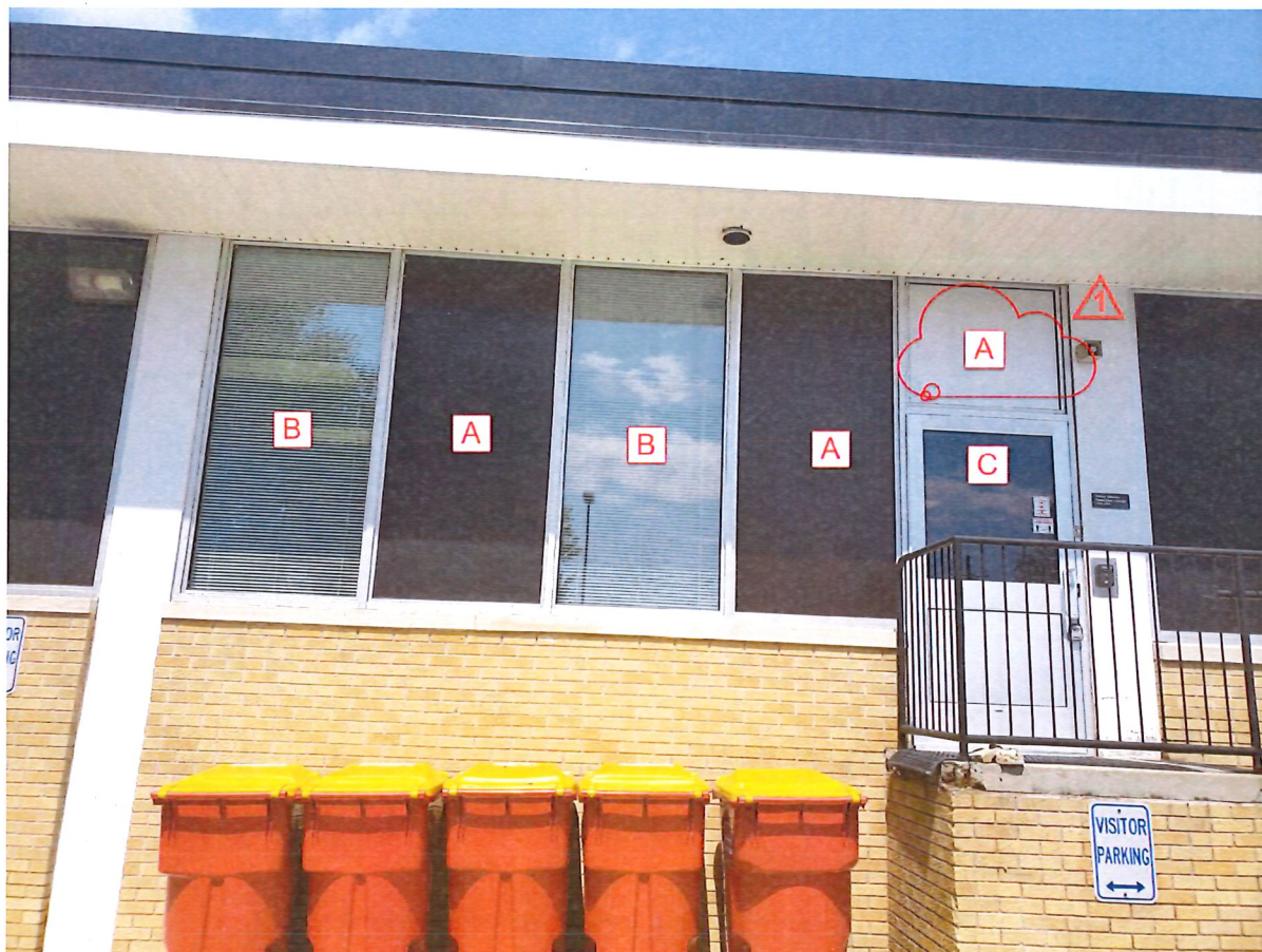
Left Side (Revised)