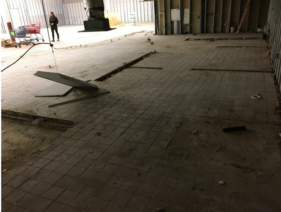
Existing Conditions Photo No. 3