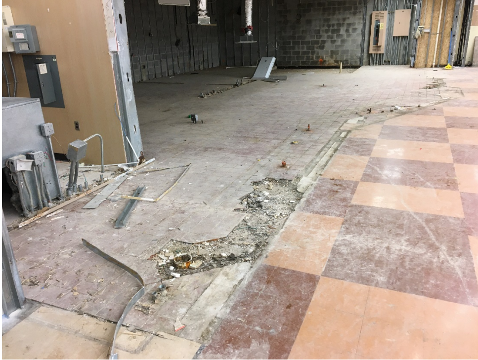
Existing Conditions Photo No. 1