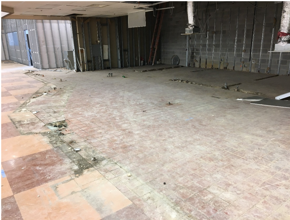
Existing Conditions Photo No. 2