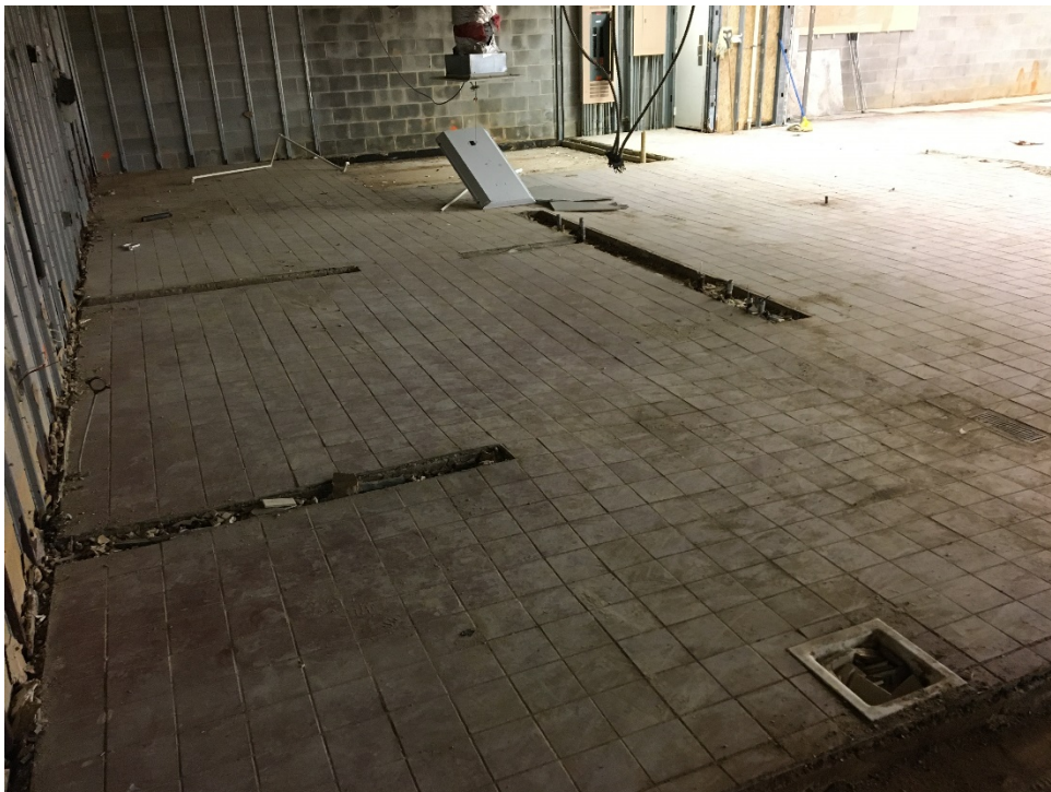
Existing Conditions Photo No. 4