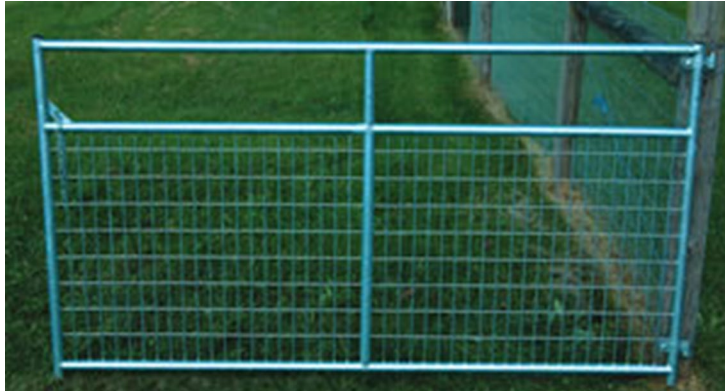
Typical Drive-through Gate Type