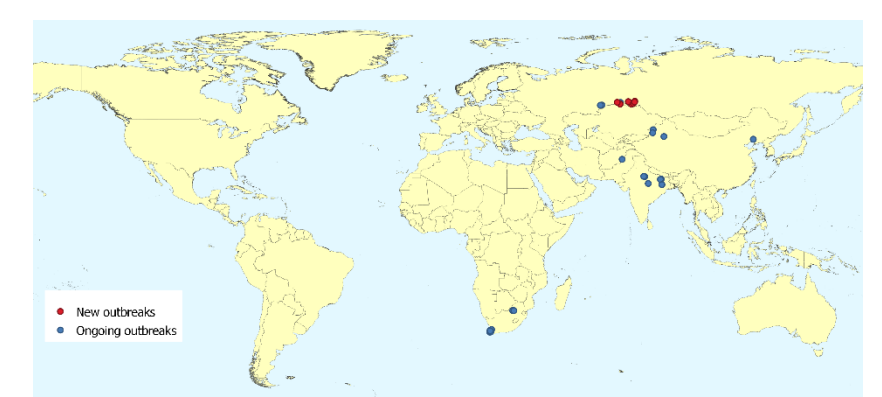
Figure 2. New and ongoing outbreaks in non-poultry, including wild birds (11 Sptember - 1 October, 2020)

In this period, 8 new outbreaks were notified in non-poultry in Kazakhstan and Russia. The total ongoing HPAI outbreaks (blue dots on the map) in these bird populations is 30. They are distributed as follows: Africa (10), Asia (15), and Europe (5).