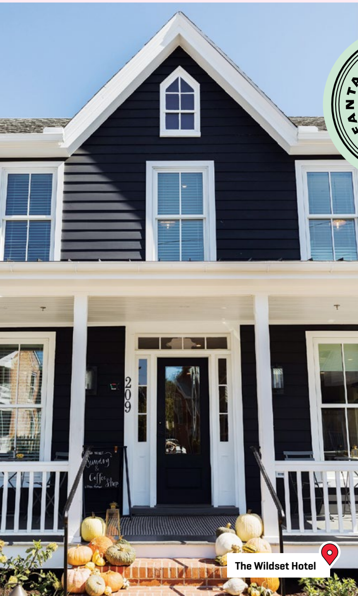
The Wildset Hotel