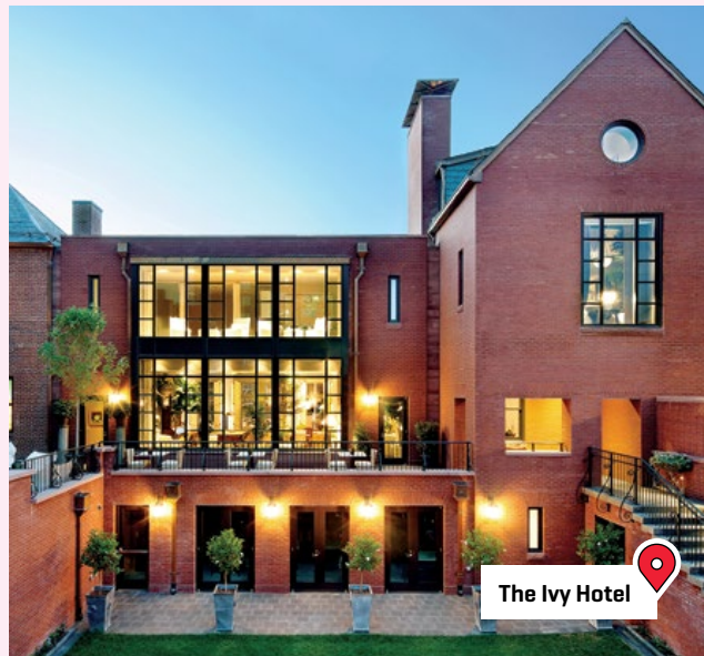
The Ivy Hotel