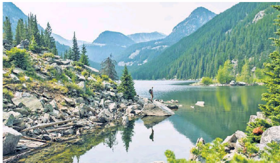
Visit Big Sky