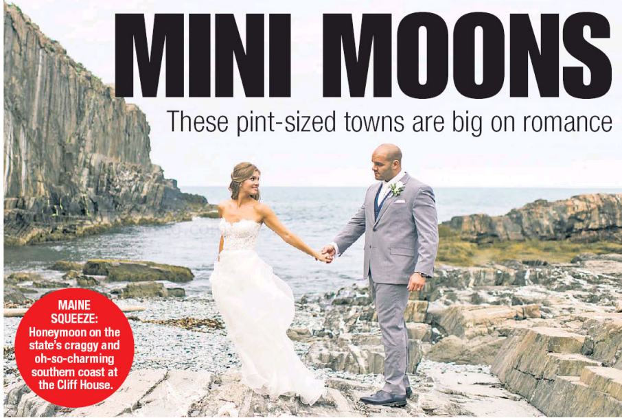
MAINE SQUEEZE: Honeymoon on the state's craggy and oh-so-charming southern coast at the Cliff House.